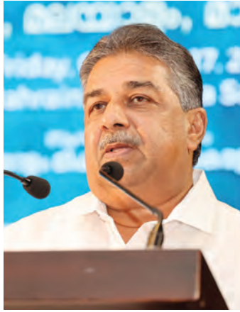
Saji Cherian, Minister for Fisheries, Culture and Youth Affairs of Kerala