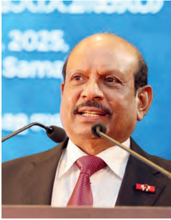
M. A. Yusuff Ali, Chairman of the Lulu Group International