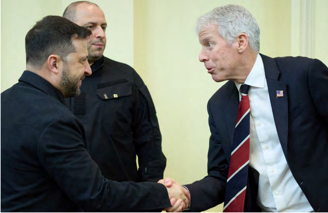
Ukraine's President Volodymyr Zelensky (L) shakes hands with US Energy Secretary Chris Wright (R) ahead of their meeting in Washington

Trump and Putin agreed to a new summit in the Hungarian capital Budapest, which would be their first since an August meeting in Alaska that failed to produce any kind of peace deal.