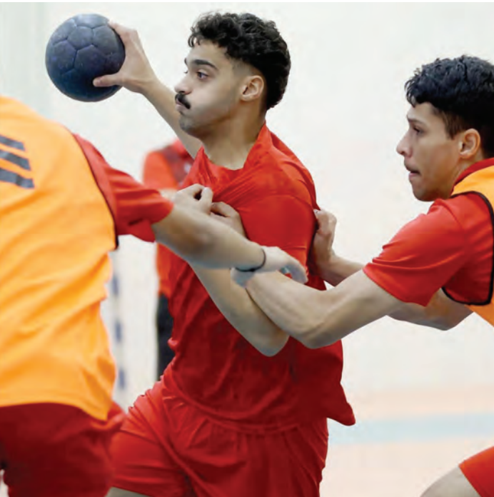
Bahrain's handball team trains ahead of opening match

The hosts arrive in form after finishing fourth at the Asian Men's U-17 Championship in