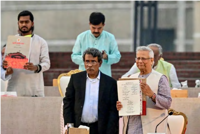
Muhammad Yunus (R), Chief Adviser of Bangladesh's Interim Government and Head of the National Consensus Commission, shows the July National Charter as representatives of various political parties look on

Bangladesh’s most powerful political parties signed a charter yesterday aimed at ensuring democratic reform after next year’s elections, following a mass uprising that toppled the previous government. Nobel Peace Prize winner Muhammad Yunus, 85, has championed the document as his legacy, saying he inherited a “completely broken down” system and that reforms are needed to prevent a return to authoritarian rule. “This is the moment we are ushering in a new Bangladesh,” Yunus told the ceremony, held in front of parliament in Dhaka. “We have been reborn.” The South Asian nation of 170 million people has been in political turmoil since Sheikh Hasina was ousted as prime minister by a student-led revolt in August 2024. The document, dubbed the “July Charter” after last year’s uprising, has sparked intense arguments between parties jostling for power ahead of polls slated for February. Yunus, who has pledged to step down after elections, says it will strengthen checks and balances between the exec-