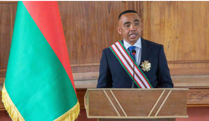
Newly sworn in President of Madagascar Michael Randrianirina speaks during his swearing in ceremony