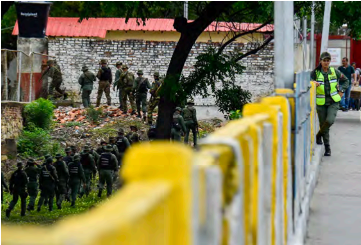
Venezuelan military patrol at the Simon Bolivar International Bridge at the Colombia-Venezuela border

At least 27 people have been killed in the US strikes so far, with the military buildup sparking