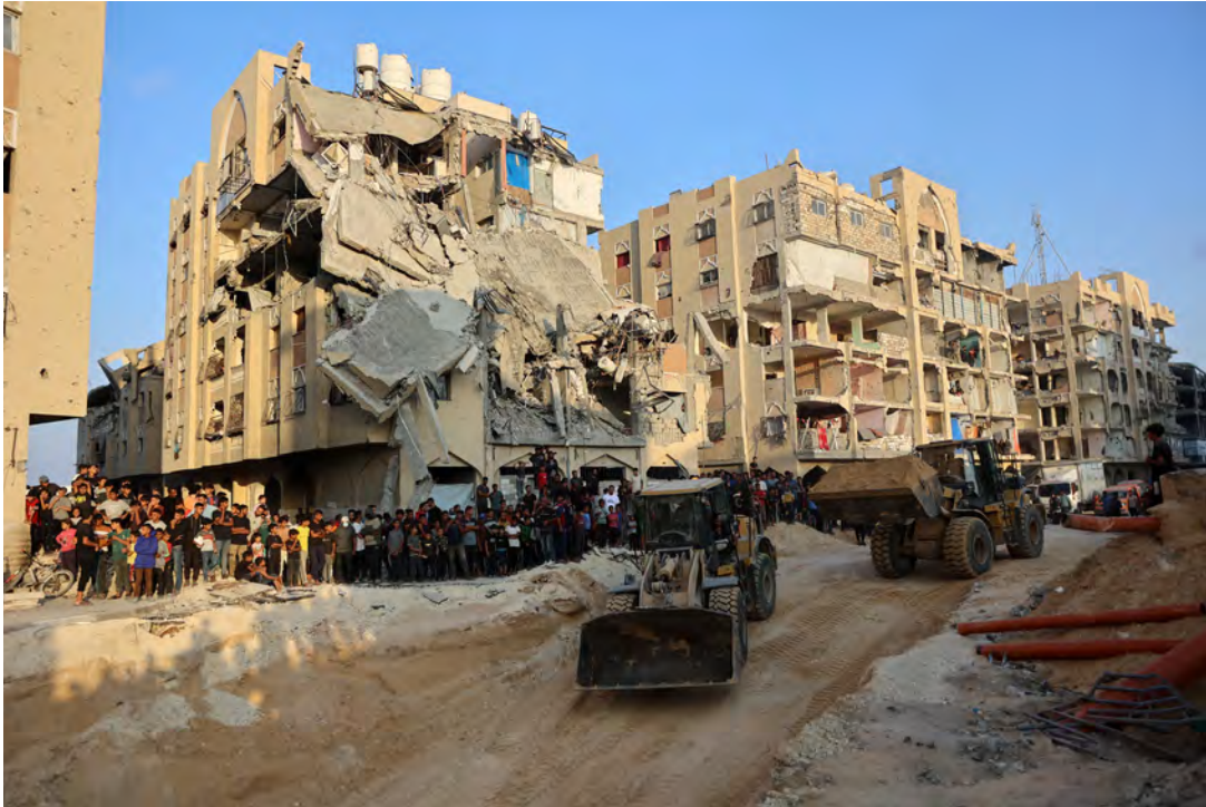
People watch as Palestinians use excavators to dig deep into the ground reportedly searching for bodies in Khan Yunis

Hamas insisted it was committed to returning all the hostage remains still unaccounted for under Gaza’s ruins, as a Turkish official said specialists dispatched to help find bodies were awaiting Israel’s authorisation to enter. Responding to a call from Hamas for help locating the bodies of the 19 hostages, buried under the rubble alongside an untold number of Palestinians, Ankara sent specialists to help in the search. A Turkish official said yesterday that dozens of disaster response specialists were at the Egyptian side of the border awaiting a green light from the Israeli government to enter the war-shattered Palestinian territory. The 81-member team from Turkey’s Disaster and Emergency Management Authority (AFAD) is equipped with specialised search-and-rescue tools, including life-detection devices and trained search dogs. “It remains unclear when Israel will allow the Turkish team