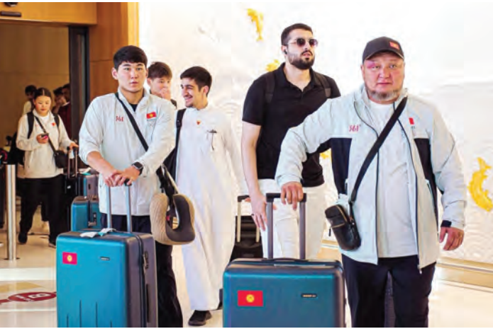
Team Kyrgyzstan arrives at the airport

Following the withdrawal of three nations, the handball competition will now be contested in