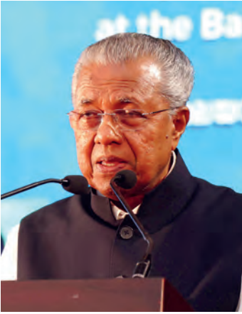
Kerala Chief Minister Pinarayi Vijayan