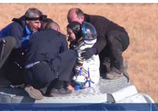
Astronaut Yulia Peresild is assisted by ground personnel

showed the reentry capsule descending under its para-