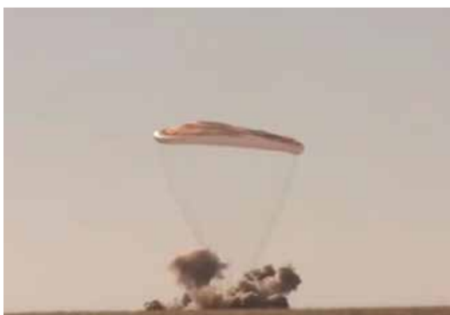
The Soyuz MS-18 space capsule lands in a remote area outside Zhezkazgan, Kazakhstan

"That's because it had seemed that 12 days was such a long period of time, but when it was all over, I