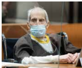
Robert Durst appears in court as he was sentenced to life without possibility of parole for the killing of Susan Berman, at Airport Courthouse, in Los Angeles, California