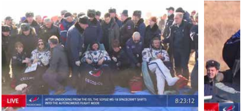
The International Space Station (ISS) crew members Roscosmos cosmonaut Oleg Novitskiy, Russian actress Yulia Peresild and film director Klim Shipenko rest in chairs after landing in a remote area outside Zhezkazgan, Kazakhstan