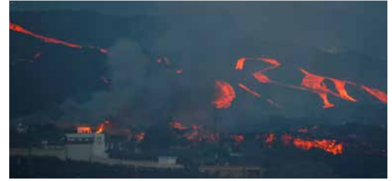
Lava spewed by the Cumbre Vieja volcano flows down a hill as it continues to erupt on the Canary Island of La Palma, as seen from Tajuya, Spain

"There are no signs that an end of the eruption is imminent even though this is the greatest desire of everyone," President Angel Vic-