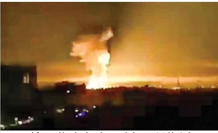
cations in the Syrian 10 people were injured in the Ascreengrab from a video showing a large explosion near Latakia, Syria, on

the sea at several lo- State-run Ikhbariya TV said coastal city of Latakia yesterday attack. Eight were discharged Monday night.