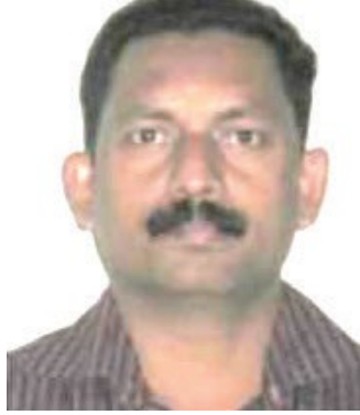
The deceased Subash

n Indian national died yesterday allegedly after being beaten up by a co-worker following a worksite quarrel in Juffair. The accused is also an Indian national, according to sources.