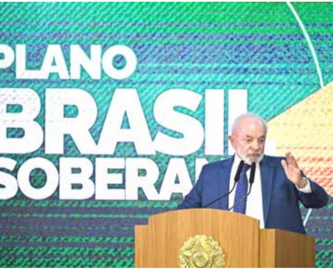
Brazil's President Luiz Inacio Lula da Silva gestures as he speaks during the signing of a decree with measures to mitigate the economic impact of the US government's increase of up to 50% in import tariffs on Brazilian products at the Planalto Palace in Brasilia

President Luiz Inacio Lula da Silva said on Saturday that he hopes Donald Trump can come and get to know the real Brazil, as the South American powerhouse reels from Washington's 50-percent tariffs. In a video taken while he planted grapes -- one of the tariff-hit goods -- Brazil's leftist leader addressed Trump. "I hope you can visit someday so we can talk and you can get to know the true Brazil, the Brazil of people who love samba, carnival, soccer, the United States, China, Russia, Uruguay, and Venezuela. We love everyone," Lula said. The tariffs imposed on Brazil are among the steepest to hit a US trading partner. And unlike with other countries, the measures against Brazil have been framed in openly political terms, with the Republican president justifying the move by alleging Brasilia is conducting a "witch hunt" against his ally, former president Jair Bolsonaro. Bolsonaro is being tried for an alleged coup attempt against Lula in 2022, and the United States recently sanctioned the judge in the case, along with seven other Supreme Court magistrates. Lula has backed the Supreme