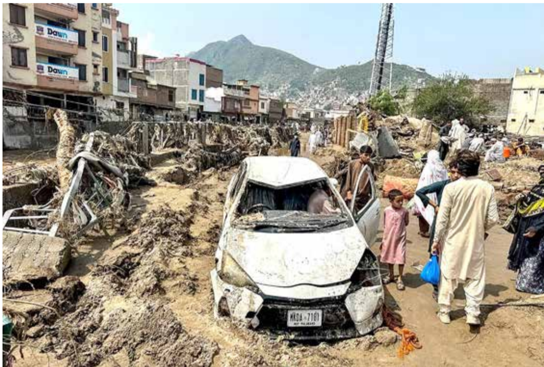
People gather near a damaged vehicle and scattered debris after the road washed out following a flash flood in Mingora, the main city of Swat Valley, in monsoon-hit northern Pakistan's mountainous Khyber Pakhtunkhwa province