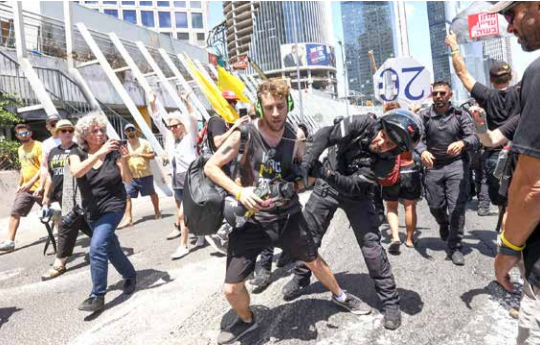
A member of the Israeli security forces arrests a demonstrator, during an anti-government protest

A huge Israeli flag covered with portraits of the remaining captives was unfurled in Tel Aviv’s so-called Hostage Square -- which has long been a focal point for protests throughout the war.