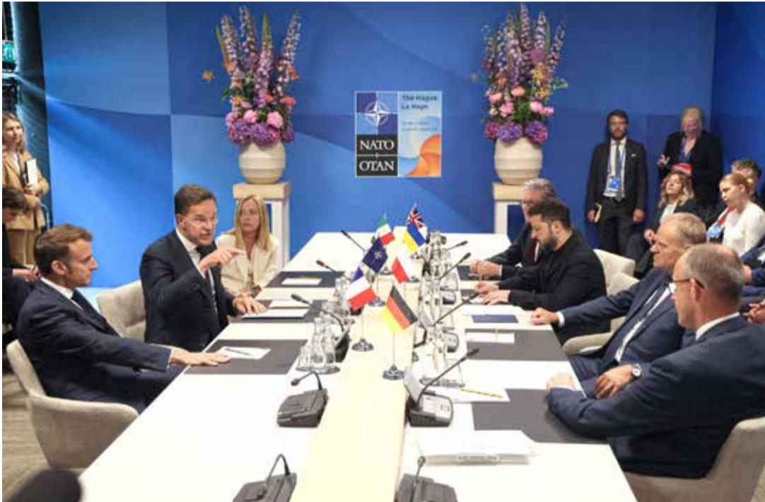
France’s President Emmanuel Macron, NATO Secretary General Mark Rutte, Italy’s Prime Minister Giorgia Meloni, Britain’s Prime Minister Keir Starmer, Ukraine’s President Volodymyr Zelensky, Poland’s Prime Minister Donald Tusk and Germany’s Chancellor Friedrich Merz take part in a meeting during a NATO summit in The Hague (file photo)

European Commission President Ursula von der Leyen, who