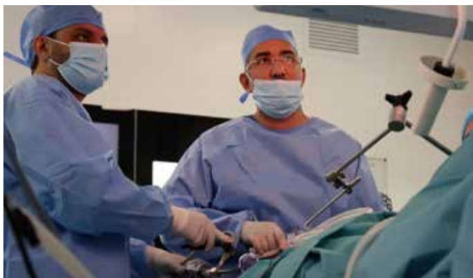
Laparoscopic gastrectomy surgery in progress

The patient reported persistent abdominal pain, severe