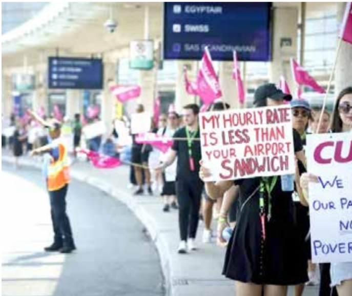
Striking Air Canada workers walk the picket line at Pearson International Airport in Toronto

Air Canada said it will resume flying yesterday after the country's industrial relations board ordered an end to a strike by 10,000 flight attendants that effectively shut down the airline and snarled summer travel. The Canada Industrial Relations Board (CIRB) "directed Air Canada to resume airline operations and for all Air Canada and Air Canada Rouge flight attendants to resume their duties by 14:00 EDT on August 17, 2025," the airline said in a statement. While it plans to resume flights yesterday evening, Canada's flag carrier warned it would take "several days before its operations return to normal." Some flights are still set to be cancelled over the next seven to 10 days, it added. Air Canada cabin crew walked off the job early Saturday over a wage dispute. Hours later, Canada's labor policy minister, Patty Hajdu, invoked a legal provision to halt the strike and force both sides into binding arbitration. "The directive, under section 107 of the Canada Labour Code, and the CIRB's order, ends the strike at Air Canada that resulted in the suspension of more