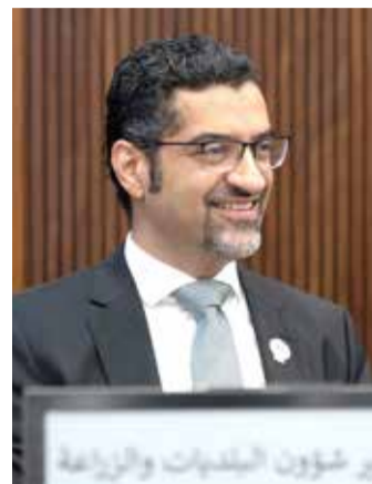
H.E. Wael bin Nasser Al Mubarak