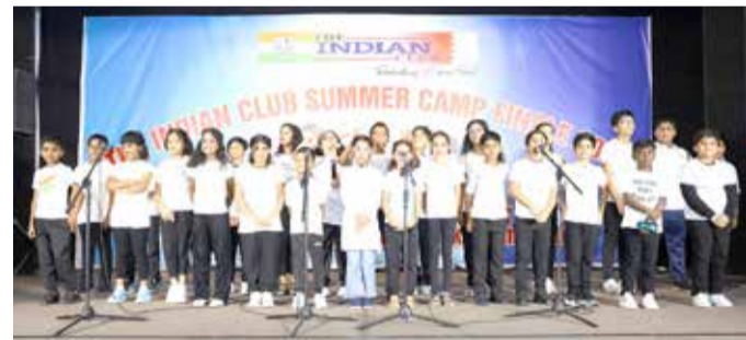
Participants take centre stage