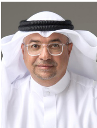
H.E. Isa bin Abdulrahman Al Hammadi