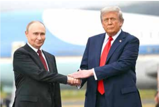
US President Donald Trump greets Russian President Vladimir Putin

his country after years of civil war "should not be with blood", rejecting any partition and accusing Israel of meddling in the south. His remarks, released by state TV yesterday, came as hundreds demonstrated in south Syria's Suweida province, denouncing sectarian violence last month and calling for the right to self-determination for the Druze-majority province.