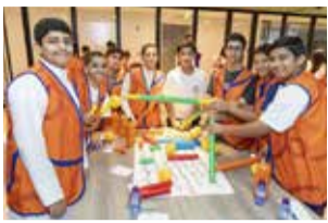
Fun and learning experience for youngsters