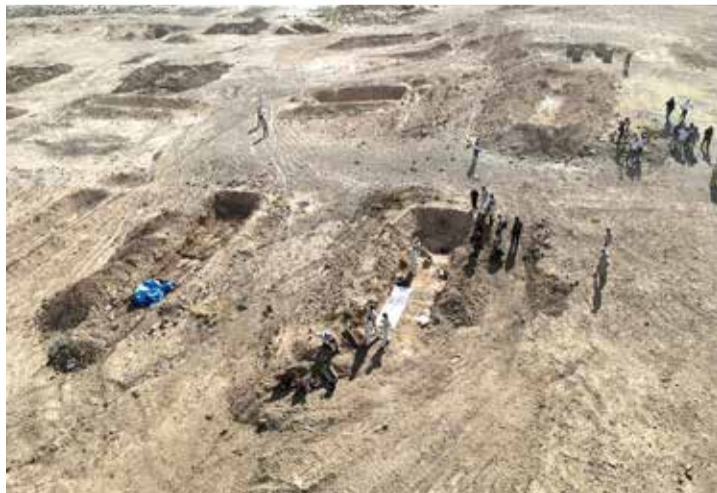
An aerial view shows the Khasfa site near the northern Iraqi city of Mosul, where authorities have begun excavating a mass grave

Assadi said that there were no precise figures for the numbers