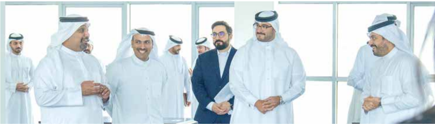
HH Shaikh Isa bin Salman bin Hamad Al Khalifa visits the Ministry of Municipalities Affairs and Agriculture and the Ministry of Information

At the Ministry of Municipalities Affairs and Agriculture, Shaikh Isa reviewed strategic municipal initiatives and was briefed on updates in the agricultural sector and sustainable urban development. HH stressed the importance of planning for sustainable growth, calling for intensified efforts to deliver initiatives that bolster food and environmental security while supporting economic development.