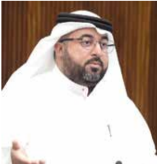
MP Hamad Al Doy

Other places have acted. The United Arab Emirates banned the game in 2018 af-