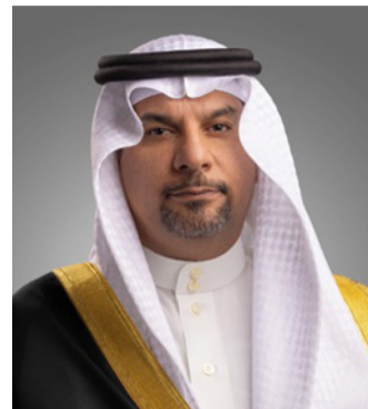
H.E. Dr. Mohamed bin Mubarak bin Daina

This commitment is anchored in advancing sustainable development goals and strengthening Bahrain's role as a regional hub for clean and renewable energy.