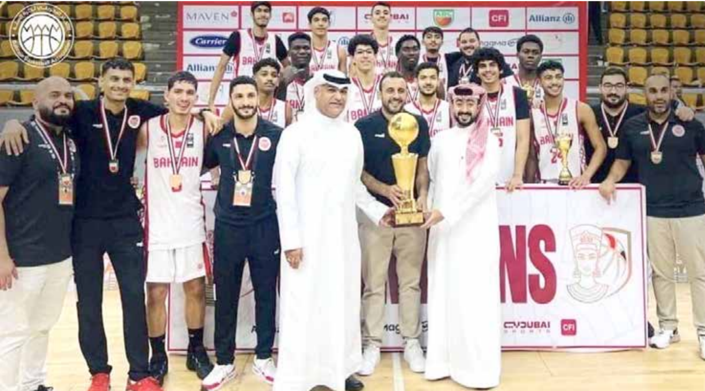
Team Bahrain being crowned champions