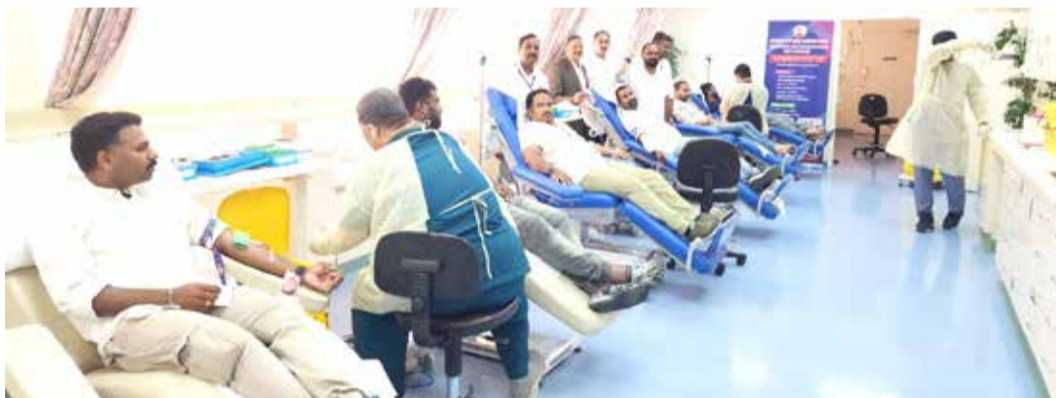
A noble initiative aimed at saving lives