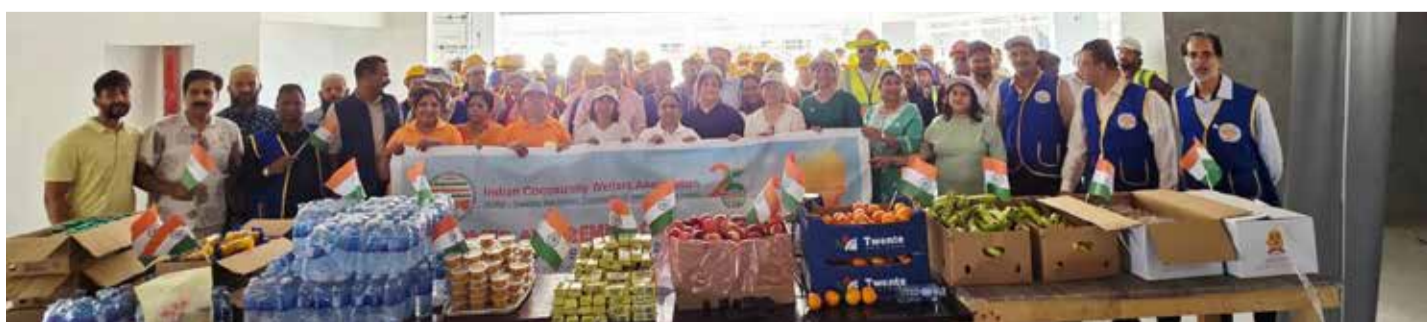
Food and refreshments distributed at the work site

This year, the event is supported by the Ministry of Interior,