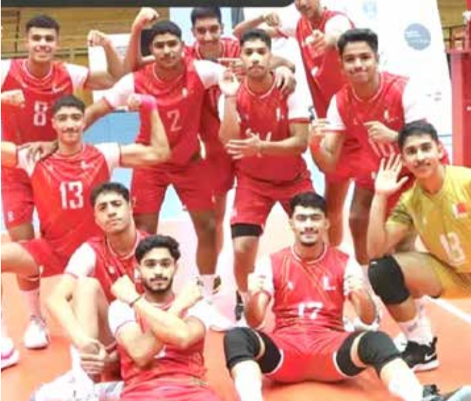
Bahrain's team celebrate at full time

rain and Kuwait tied on three points, as Kuwait had earlier swept Palestine 3-0. With two sides already staking a claim in the group, Bahrain's focus now turns to sustaining their momentum.