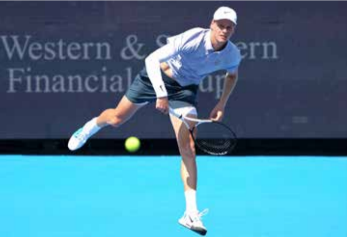
Jannik Sinner serves during the match against Terence Atmane

Alcaraz and Sinner have played for trophies this season in Rome, Roland Garros and Wimbledon, with the Italian winning their most recent at the All England Club last month. Sinner, celebrating his 24th birthday, ended Frenchman Atmane's dream run and will now try to become the first man since Roger Federer in 2014-15 to win back-to-back titles in Cincinnati. Sinner, tuning up for the US Open in his first tournament since winning Wimbledon, hasn't dropped a set en route to the final. "It's a very, very tough challenge every time you play a new opponent," Sinner said. "In the later stages of the tournament, the pressure is on, they deserve to be there." Alcaraz will also be playing in his second Cincy final