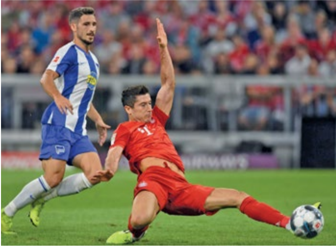
Bayern Munich's Polish forward Robert Lewandowski (R) scores the opening goal next to Hertha Berlin's Australian midfielder Matthew Leckie