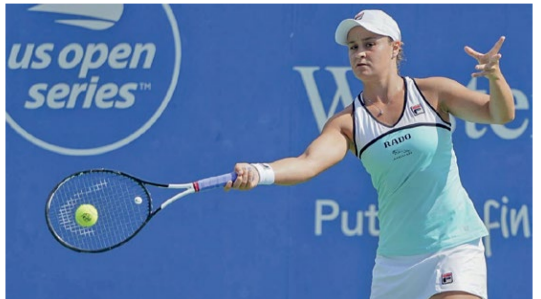
Ashleigh Barty of Australia returns a shot to Maria Sakkari of Greece

"I don't even really think about winning the tournament. I just want to have the chance to play it. now.