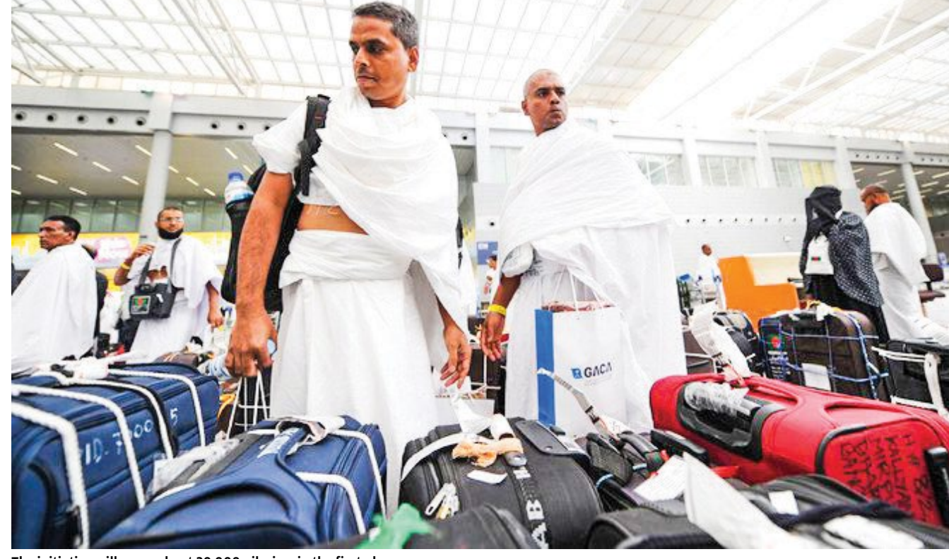
The initiative will serve about 30,000 pilgrims in the first phase.

Mansouri thanked all the governmental and nongovernmental bodies participating in the initiative.