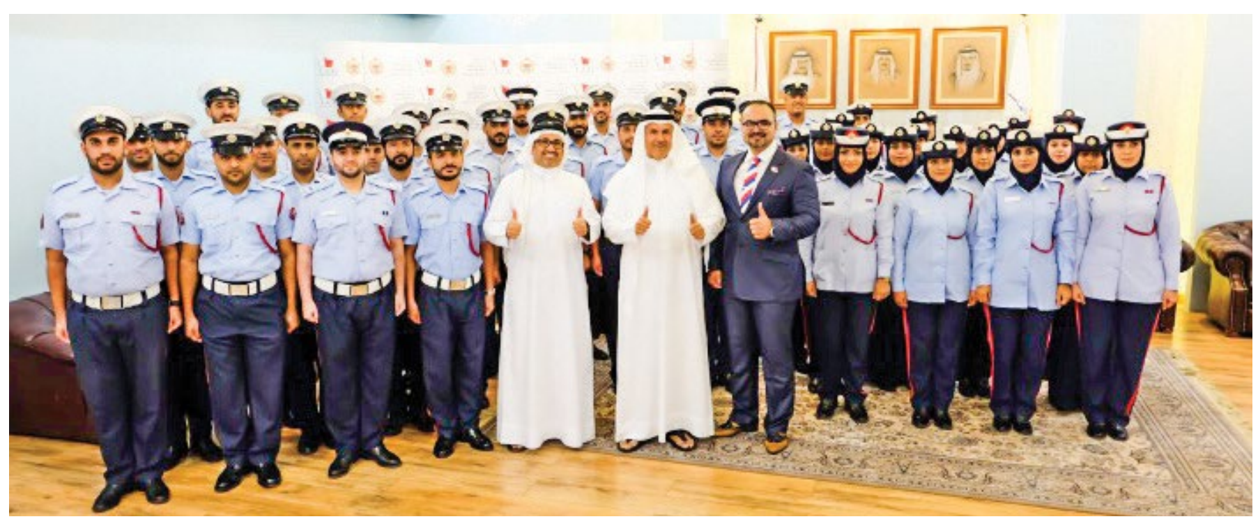
The Interior Ministry was praised over winning the honour.

The programme secured International Stevie Award 2019 in two categories