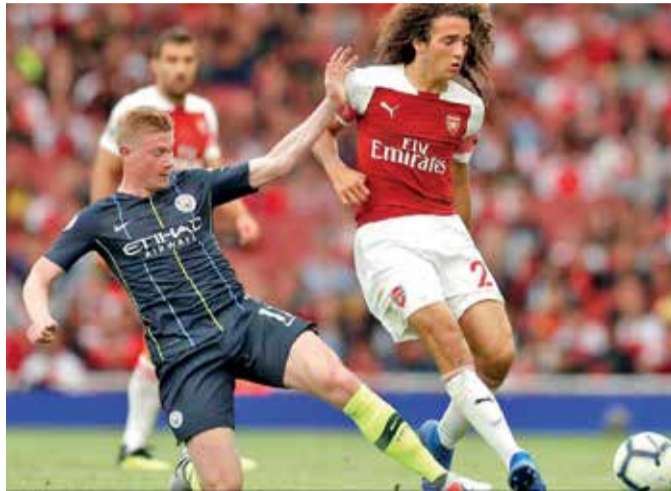
Manchester City's Kevin de Bruyne in action against Arsenal last week