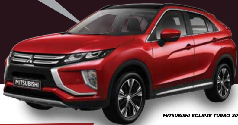
MITSUBISHI ECLIPSE TURBO 2018 Model