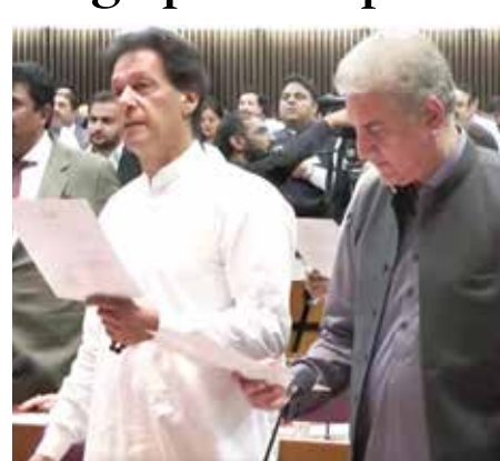
Imran Khan was picked by Pakistan lawmakers in the National Assembly as the Prime Minister.

by the speaker of the house ruption charges.