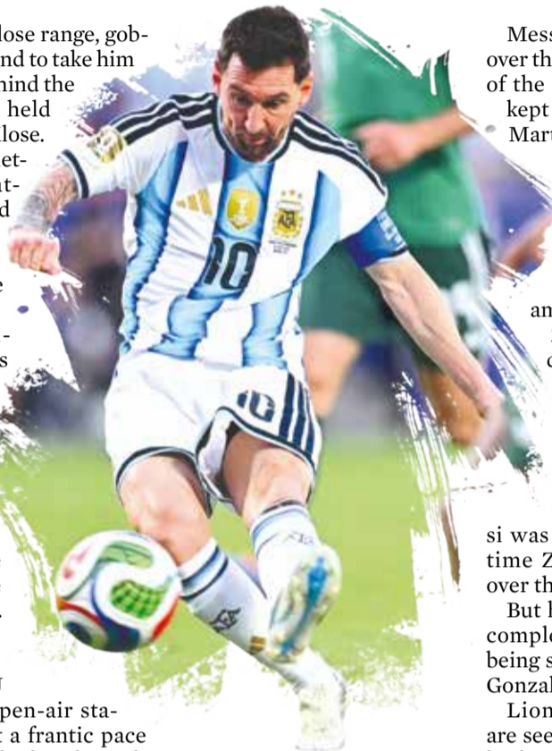
Lionel Messi scores Argentina's opener

beautifully measured through ball which Messi picked up before driving at goal and unleashing a fierce drive from outside the penalty area that curled away from Zidane.