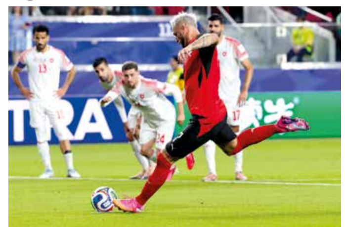
Marko Arnautovic #7 of Austria scores the team's third goal from penalty