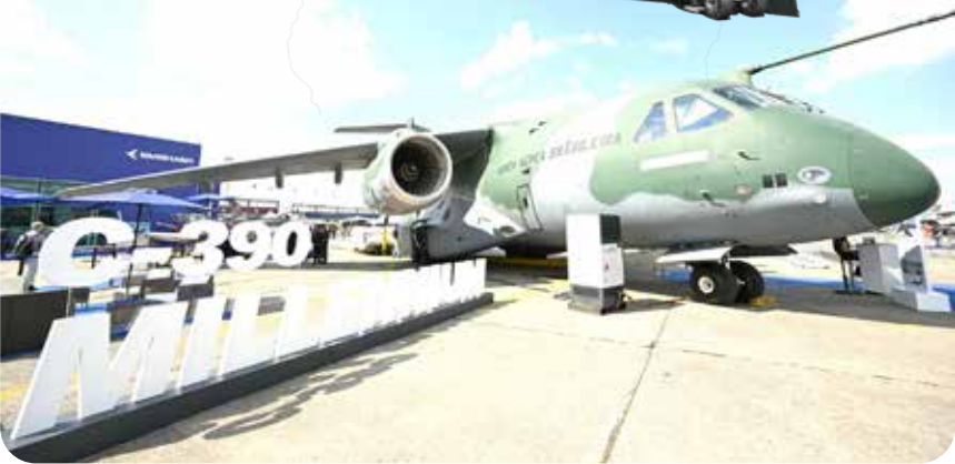
a military aircraft Embraer KC-390 Millennium of the Brazilian Air Force