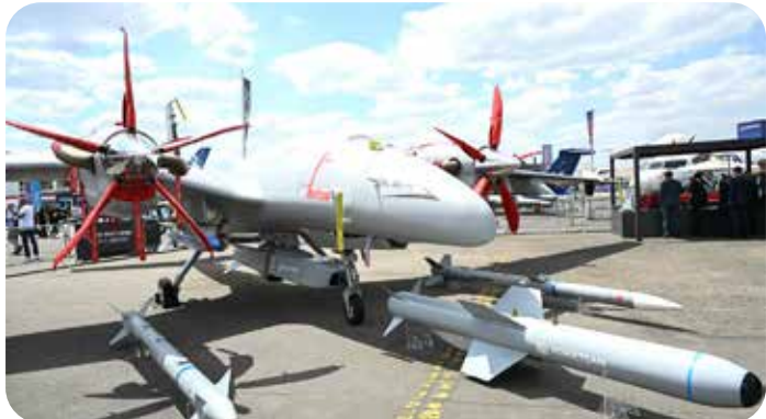
Leonardo and Baykar LBA Systems' Bayraktar Akıncı combat drone

opment, cultural exchange and global connectivity," she added.