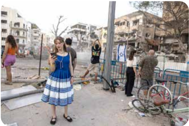
People visit the site of an Iranian missile attack in central Tel Aviv which left several destroyed buildings

Netanyahu said Israel was “changing the face of the Middle East” with its military campaign, which could lead to “radical changes” in Iran.