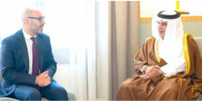
HRH the Crown Prince and Prime Minister with H.E. Dr Marcin Czepelak

HRH Prince Salman underscored the Kingdom's continued efforts to strengthen its