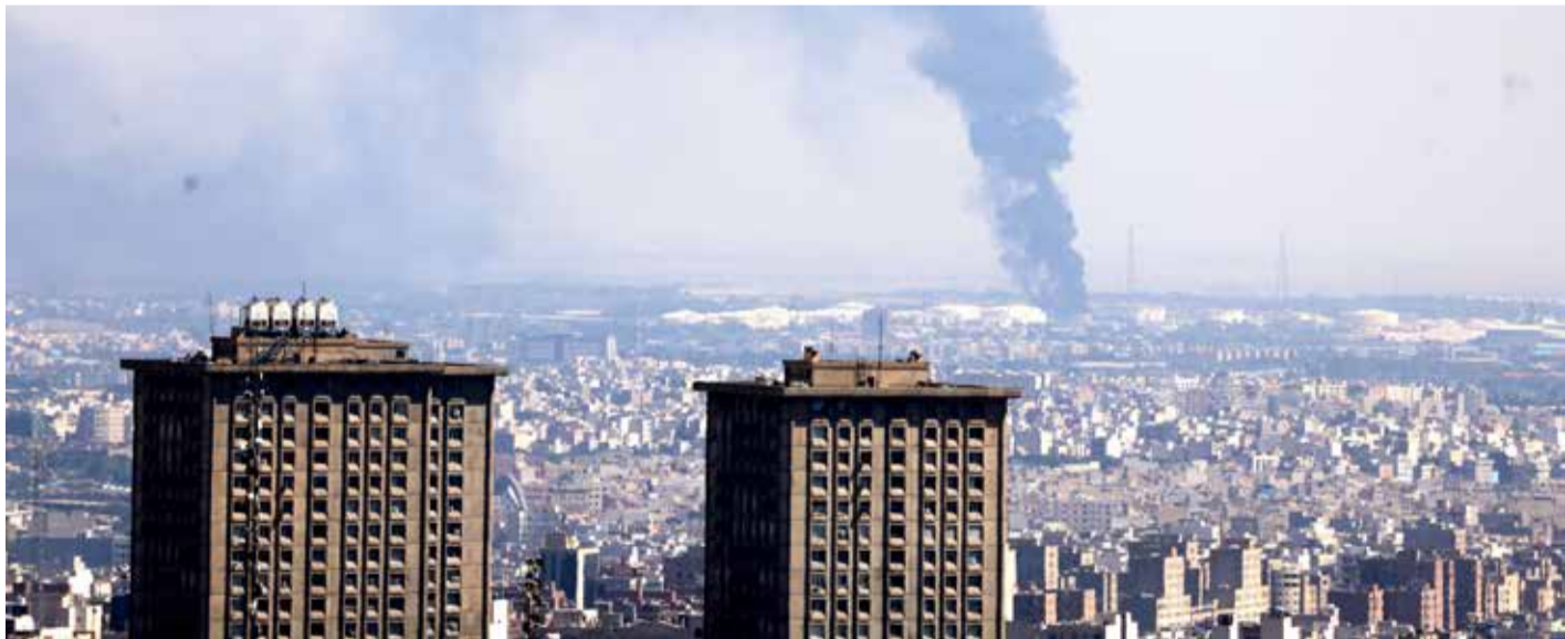
Smoke billows in the distance from an oil refinery following an Israeli strike on the Iranian capital Tehran.

Trump demands Tehran to 'surrender' as Israel presses attacks for fifth day