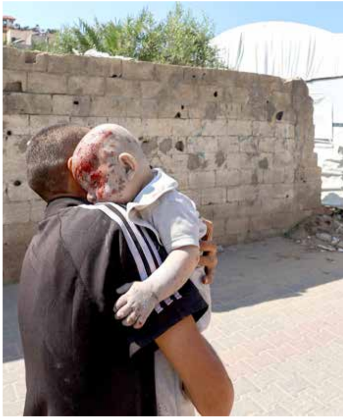
A Palestinian man carries a wounded child in Al-Bureij camp in the central Gaza Strip after the area was targeted by an Israeli strike

“We are monitoring this on a daily basis,” foreign ministry spokesman Majed al-Ansari told a news conference. “We have nothing to be concerned about right now, but obviously prolonged escalation will have unpredictable consequences.”