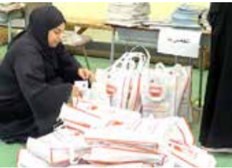
All set for the new academic year

The Ministry of Education has confirmed that all public schools across the Kingdom have finalised preparations for the distribution of textbooks for the upcoming 2025–2026 academic year. The distribution process is scheduled to begin on Sunday, June 22, 2025, allowing students and their parents to collect textbooks from their respective schools in accordance with each school's designated schedule and guidelines. The Ministry stated that distributing textbooks ahead of the summer vacation will enable students to review the curriculum in advance, better preparing them for the new academic year. It will also help schools ensure a smoother start to the school year by reducing the logistical pressures of textbook distribution upon students' return. Dedication and coordination His Excellency Dr. Mohamed bin Mubarak Juma, Minister of Education, praised the dedication and coordination of educational and administrative teams who completed the preparations in line with the approved plan and deadlines. He expressed his heartfelt appreciation to all those involved — across various roles and specializations — for their efforts in curriculum development, textbook design and production, logistical supervision, and school-level readiness. Dr. Juma noted that more than two million textbooks will be distributed to students across all public schools as part of the Ministry's commitment to delivering high-quality educational resources and ensuring a smooth start to the academic year.