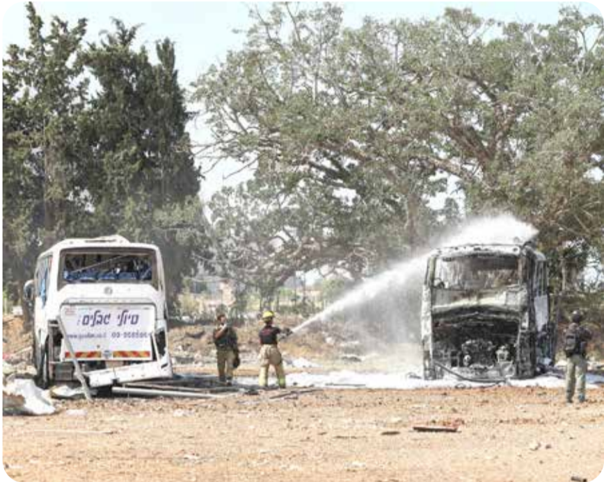
An Israeli firefighter douses a bus carcass at the impact site of an Iranian missile at a bus depot in Herzliya near Tel Aviv