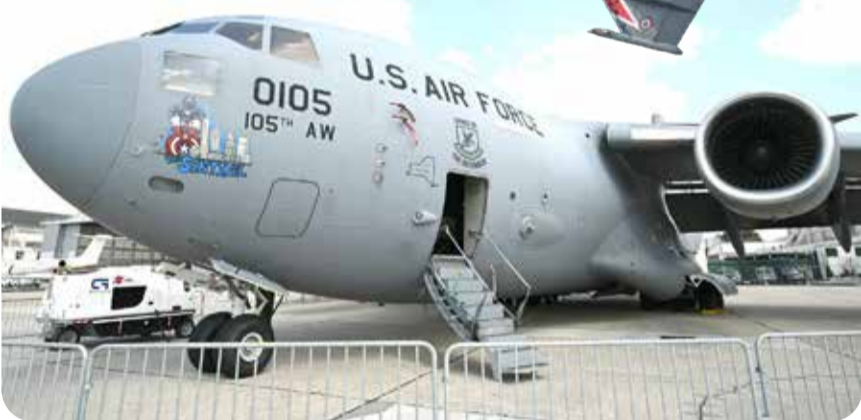
a C-17 aircraft of the 105th Airlift Wing (105 AW), a unit of the New York Air National Guard, on display during the Paris International Air Show

"These modern and efficient aircraft have been instrumental in Vietjet's growth, helping us make air travel more accessible and affordable for millions, while strengthening our role as a connector for economic devel-