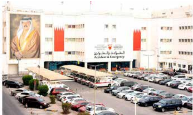
Salmaniya Medical Complex