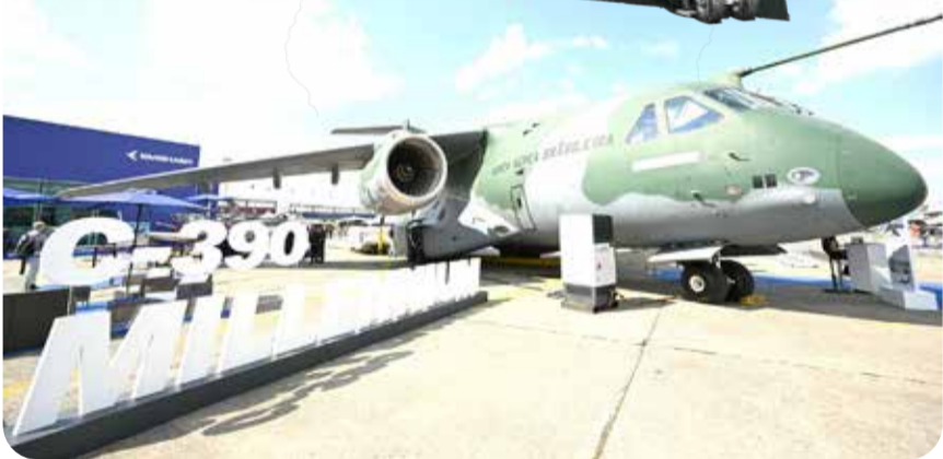
a military aircraft Embraer KC-390 Millennium of the Brazilian Air Force