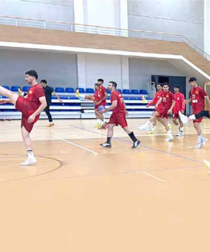
Bahrain's handball team making the final preparations in Poland ahead of today's opener

Bahrain begin their campaign against one of the most consistent junior teams in handball. Spain are past champions (2017) and five-time silver medallists. The Spaniards hold a highly structured system with quick ball circulation, and they enter the group as clear favourites. For Bahrain, slowing the tempo and staying composed will be critical if they're to stay competitive. The second test vs Egypt on Thursday is also a tough task. The reigning African champions bring a direct, physical style of play that has caused problems for European sides in recent years. Winners in 1993 and