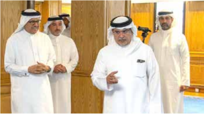
HRH Prince Salman visits the Al-Madar Center at the Ministry of Foreign Affairs