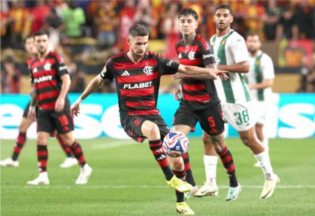
Flamengo's Italian midfielder #21 Jorginho controls the ball

Brazilian giants Flamengo set themselves up for a Club World Cup showdown with Chelsea by easing to a 2-0 win against Esperance of Tunisia in their opening game at the tournament on Monday. Goals either side of half time from Uruguayan international Giorgian de Arrascaeta and Luiz Araujo gave a dominant Flamen-