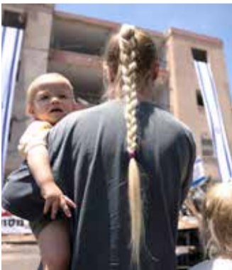
A woman carries a baby next to a girl in front of a building hit during an Iranian missile strike in Haifa

Iran’s Revolutionary Guards said they launched on Tuesday an attack targeting Israeli air bases from which they claim fighter jets have taken off to strike the Islamic republic. “In the new wave of attacks, a large-scale missile operation was carried out against the air bases of the Zionist regime’s army, which are the bases from which the regime’s fighter jets take off towards our beloved country,” the Guards said in a statement carried by state TV.