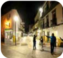
Spain says ‘overvoltage’ caused huge April blackout

◆ A major power outage that paralysed the Iberian Peninsula in April was caused by “overvoltage” on the grid that triggered “a chain reaction”, according to a government report released yesterday. The blackout had “multiple” causes, Ecological Transition Minister Sara Aagesen told reporters following a cabinet meeting, adding the system “lacked sufficient voltage control capacity” that day. Overvoltage is when there is too much electrical voltage in a network, overloading equipment. It can be caused by surges in networks due to oversupply or lightning strikes, or when protective equipment is insufficient or fails. When faced with overvoltage on networks protective systems shut down parts of the grid, potentially leading to widespread power outages. Aagesen singled out the role of the Spanish grid operator REE and certain energy companies she did not name which disconnected their plants