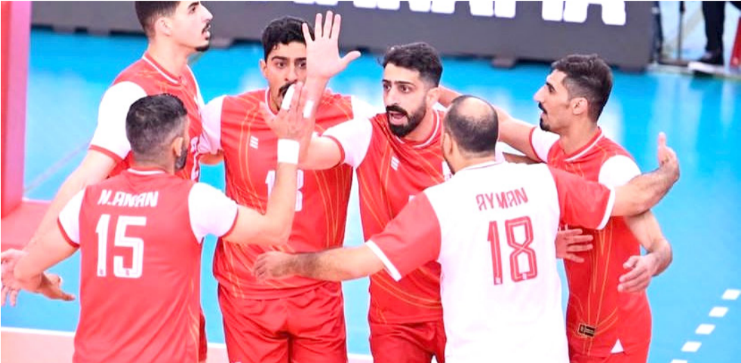
Bahraini players celebrating the win at full time

ping the second set. The result gives Bahrain a major boost heading into their next group fixture against Indonesia, who they face at 7pm tomorrow night.