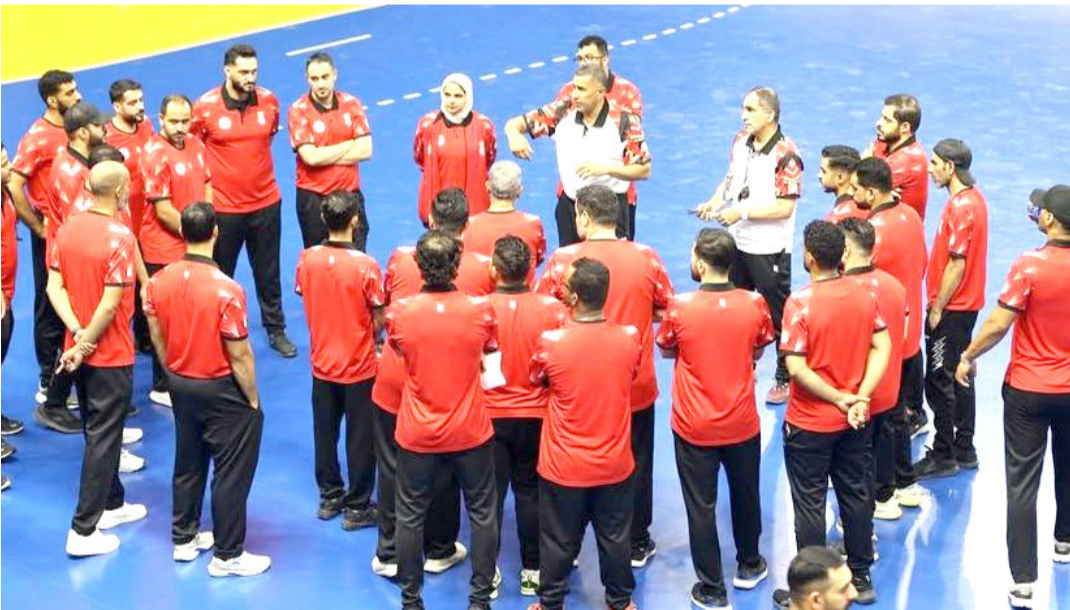
Team during a discussion

well be the key. While not as decorated as their other opponents, Saudi Arabia qualified through the 2024 Asian Championship and have a long history of close matches with Bahrain. One such encounter came in the 2018 Asian Junior Championship, where Bahrain won 29-28. Another close match is expected in Kielce — and this