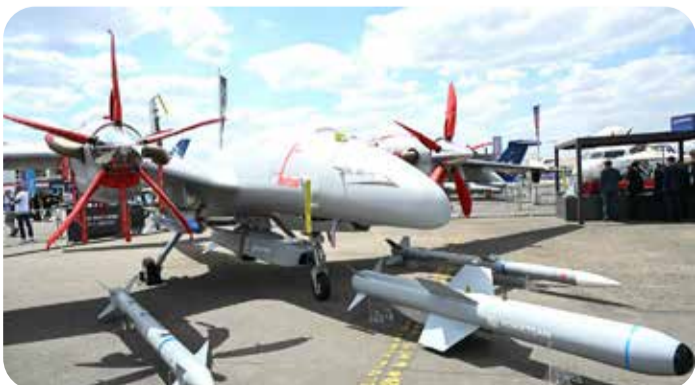
Leonardo and Baykar LBA Systems' Bayraktar Akinci combat drone

opment, cultural exchange and global connectivity," she added.