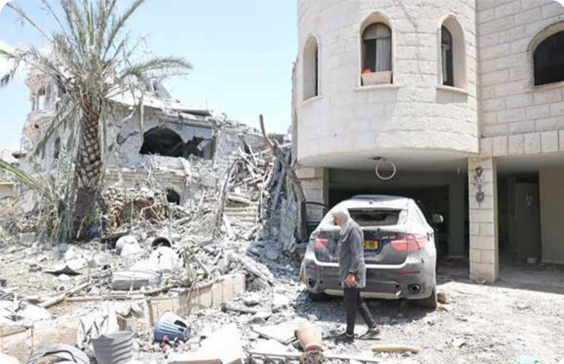
A woman checks the destruction in the northern Arab-Israeli city of Tamra

US President Donald Trump said he wants a “real end” to the conflict between Israel and Iran, not just a ceasefire, as the arch foes traded fire for a fifth day yesterday.