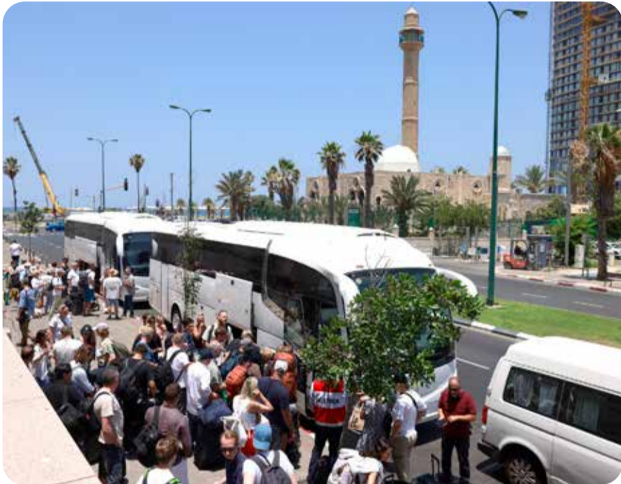
People arrive with their luggage before the departure of buses slated to evacuate foreign passport holders, mainly European and Polish, out of Israel, at a meeting point in Tel Aviv