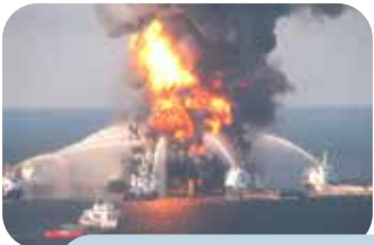
24 rescued as oil tankers collide off UAE, sparking fire

◆ Twenty-four crew have been rescued after two oil tankers collided off the UAE, sparking at least one fire, the United Arab Emirates coastguard and a shipping company said yesterday. British maritime security monitor Ambrey said the incident, which took place at a time of high tensions as an air war rages between nearby Iran and Israel, was “not security-related”. Shipping company Frontline said a fire was extinguished on its Front Eagle tanker after the collision with Adalynn, another oil transporter, 15 nautical miles off the UAE’s Gulf of Oman coast. “We are (also) aware of reports of a fire onboard the Adalynn following the collision,” a Frontline statement said, adding: “There have been no reports of pollution at this time.” The UAE coastguard carried out “an evacuation mission involving 24 crew members of the oil tanker ADALYNN, following a collision between two ships in the Gulf of Oman”, the UAE National Guard posted on X.