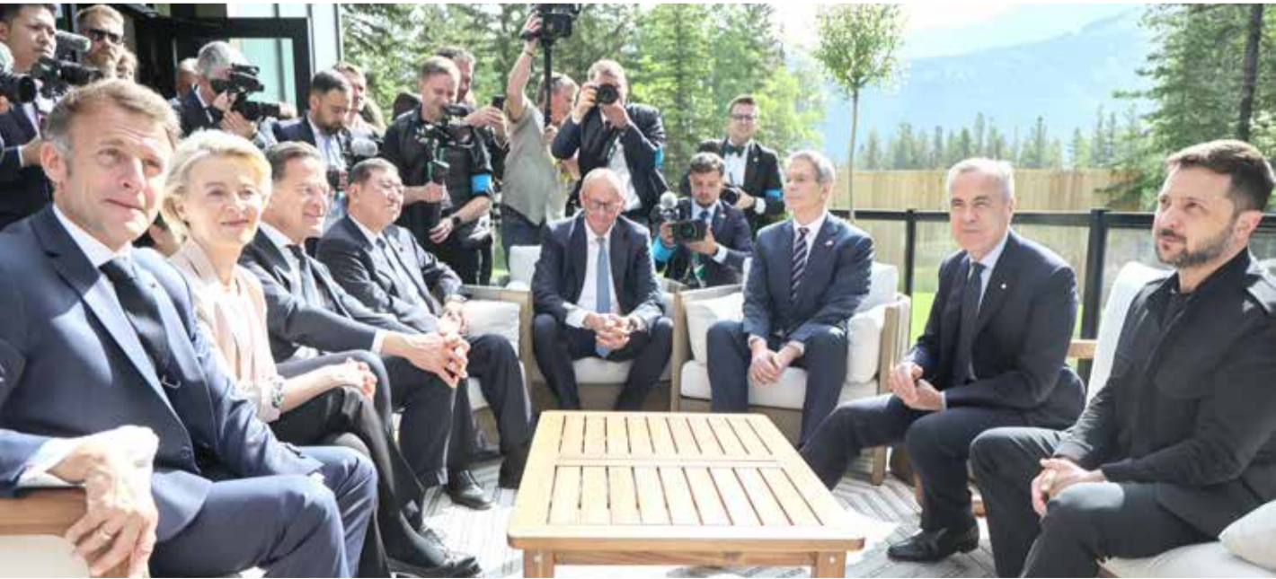
(L/R) French President Emmanuel Macron, European Commission President Ursula Von der Leyen, NATO Secretary General Mark Rutte, Japanese Prime Minister Shigeru Ishiba, German Chancellor Friedrich Merz, US Secretary of Treasury Scott Bessent, Canadian Prime Minister Mark Carney, and Ukrainian President Volodymyr Zelenskyy during the Group of Seven (G7) Summit at the Pomeroy Kananaskis Mountain Lodge in Kananaskis, Alberta, Canada

duties is due to expire on July 9, though the White House has indicated it could extend the deadline for countries that it believes are negotiating in good