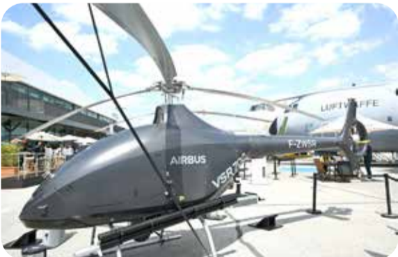
An Airbus Helicopter VSR700