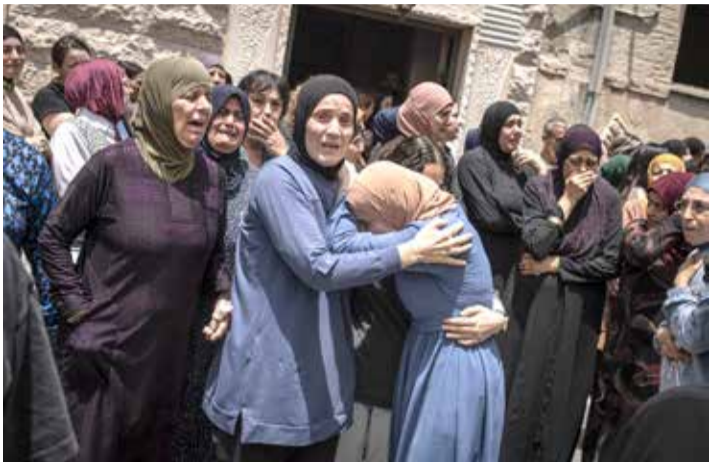
Mourners react during the funeral of victims of an Iranian missile attack which destroyed a three-storey building in the northern Arab-Israeli city of Tamra on the weekend killing four women, during a funeral in Tamra

German Chancellor Friedrich Merz on Tuesday expressed strong support for Israel in its military campaign against Iran as he spoke with German media on the sidelines of the G7 summit in Canada. "This is the dirty work Israel is doing for all of us," Merz said in an interview with the ZDF broadcaster. "We are also victims of this regime. This mullah regime has brought death and destruction to the world," he said. In a separate interview with Welt TV, Merz also suggested Israel's attacks on Iran could lead to the demise of the Islamic republic's leadership. "I assume that the attacks of