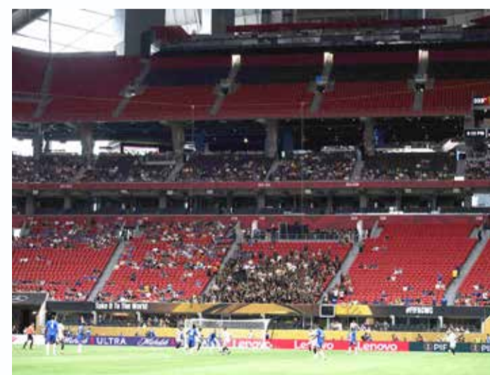
General view inside the stadium with empty seats in the stands

UEFA Champions League winners Paris-Saint Germain and