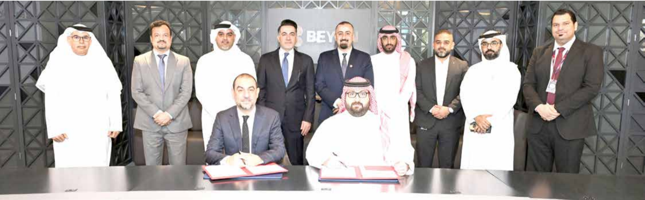
Officials during deal signing