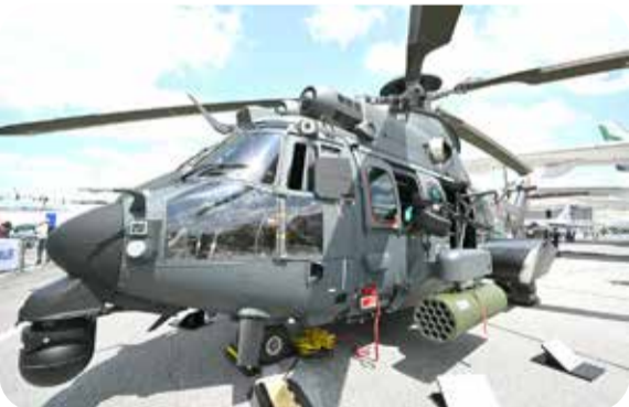
an Airbus Helicopter H225M