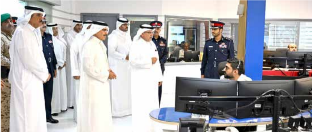
HRH Prince Salman visits the Main Operations Room of the Ministry of Interior

These efforts reflect the Kingdom's preparedness to effectively manage challenges in light of current regional and international developments.