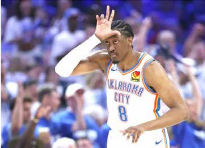
Jalen Williams celebrates a three-pointer

The win leaves the Thunder 3-2 up in the best-of-seven se-