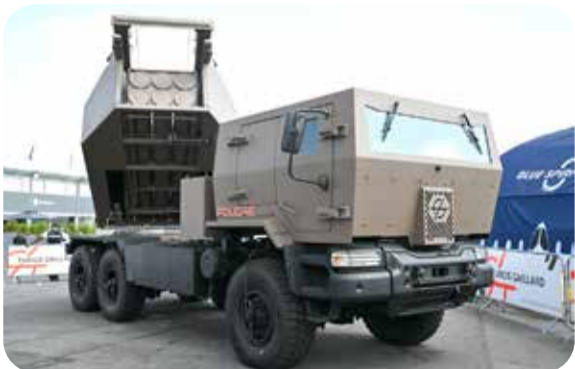
France's Turgis and Gaillard Group's collaborative long-range strike system Foudre