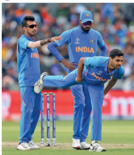
Bhuvneshwar Kumar leaves the field of play after picking up an injury