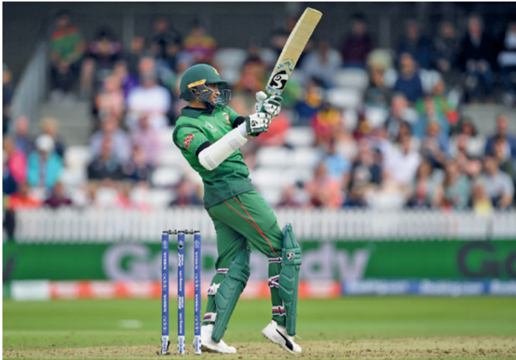
Bangladesh's Shakib Al Hasan plays a shot

But the Tigers had already posted 330 in the first innings of their win over South Africa earlier in the competition and they were never intimidated by