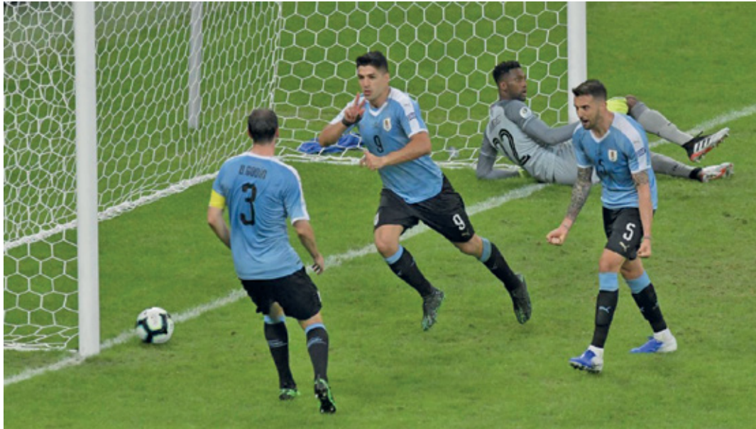
Uruguay's Luis Suarez celebrates after scoring against Ecuador

lamented Ecuador's Colombian coach Hernan Dario Gomez.