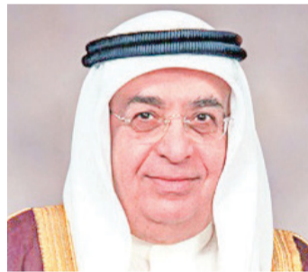
HH Shaikh Mohammed

The mechanism will be included in the follow-up system