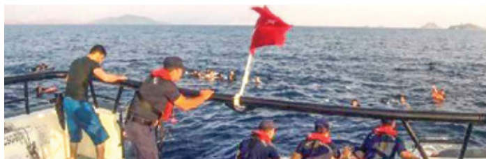
Turkish Coast Guard rescue illegal migrants after their boat sank in the Aegean sea.

The coast guard said 31 other migrants were rescued after the boat capsized in the Aegean Sea, off the coast of Bodrum. The region is close to the Greek island of Kos.