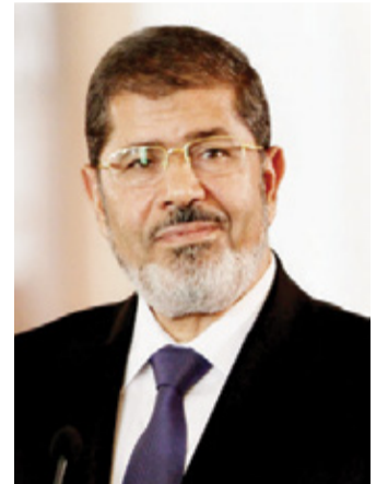
Mursi, a top figure in the Muslim Brotherhood, was toppled by the military in 2013.

Egypt's state TV said the country's former President Mohamed Mursi collapsed during a court session and died on Monday.