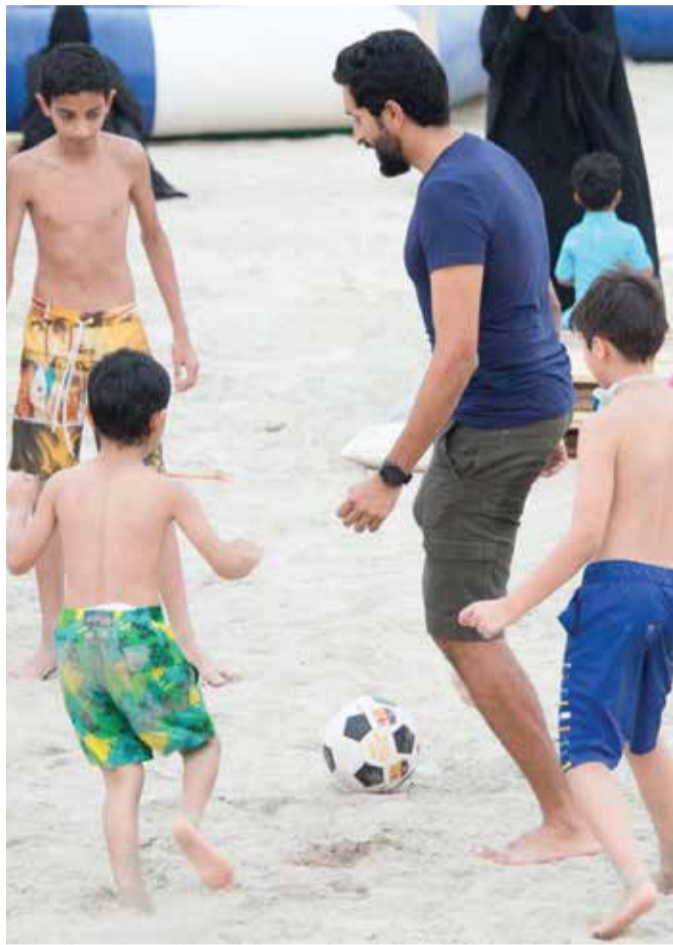
His Majesty's Representative for Charity Works and Youth Affairs, Chairman of Supreme Council for Youth and Sports Affairs and Bahrain Olympic Committee President His Highness Shaikh Nasser bin Hamad Al Khalifa hosted an Eid Al Fitr entertainment event for the families and children of the martyred servicemen affiliated with the Bahrain Defence Force and the Ministry of Interior. Shaikh Nasser paid tribute to Bahrainis for their dedication and sacrifices for the sake of their homeland, to protect the security and stability of the Kingdom and confront terrorists.

The army took control of Hodeidah's airport on Saturday, and is continuing an offensive to liberate the city from Iran-backed Houthi militants.