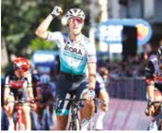
Peter Sagan crosses the finish line

Bora-Hansgrohe accelerated on the short ascent to Valico