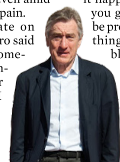
Robert De Niro

The actor also noted that he didn't think the injury would affect his performance as cattleman William Hale.