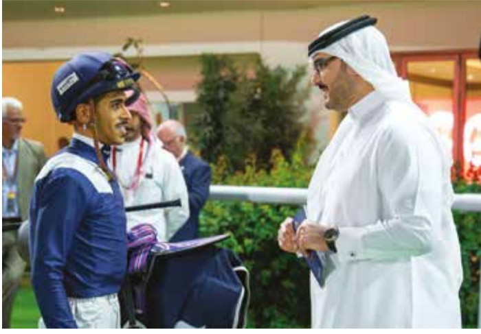
His Highness Shaikh Isa bin Salman bin Hamad Al Khalifa attends the REHC concluding round