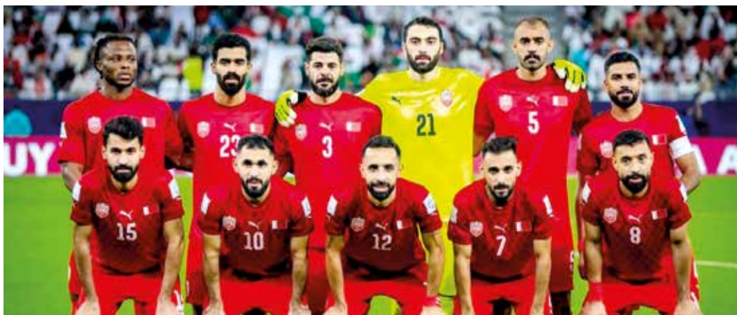
Bahrain's senior men's football national team

That preparation is being shaped with several major targets in mind. Later this year, Bahrain will head into the Gulf Cup as defending champions and aim to retain the title they secured in the previous edition. That campaign is expected to set the tone for what follows, with competitive momentum