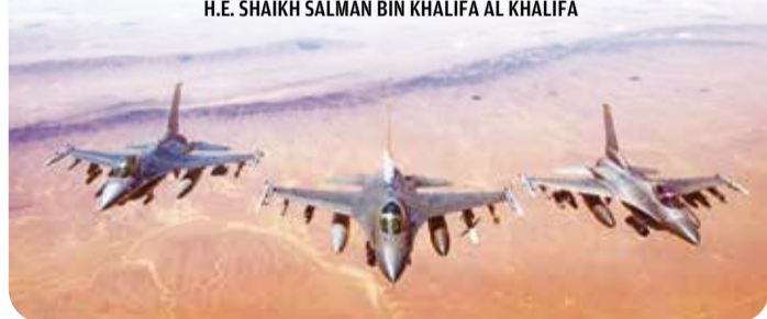
U.S. Air Force F-16s conduct readiness patrols across the U.S. Central Command area, reinforcing the forward military posture in the Middle East.

H.E. SHAIKH SALMAN BIN KHALIFA AL KHALIFA