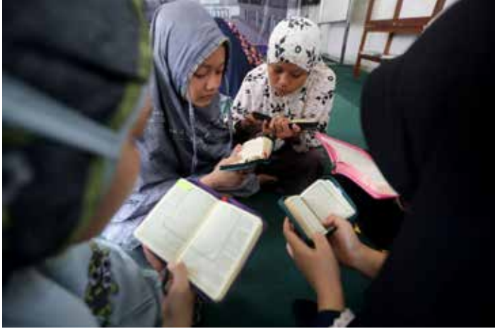
Indonesian muslim students read the Koran in their class room at the Sirajussa'adah Boarding School in Depok, West Java, Indonesia