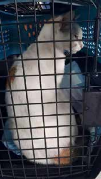
a white cat in a cage after being intercepted bearing an assortment of drugs in a pouch tied to its body

Authorities in Panama on Friday intercepted an unlikely smuggler, a fluffy white cat, bearing an assortment of drugs in a pouch tied to its body as it tried to enter a prison. The feline felon was stopped outside the Nueva Esperanza jail, which houses more than 1,700 prisoners, in the Caribbean province of Colon, north of the capital Panama City. “The animal had a cloth tied around its neck” that contained wrapped packages of white powder, leaves and “vegetable matter”, according to Andres Gutierrez, head of the Panama Penitentiary System. They were likely cocaine, crack and marihuana, according to another official. This is not the first such attempted critter crime. Prisoners use food to lure animals to them, once the creatures had been loaded with drugs by people on the outside.