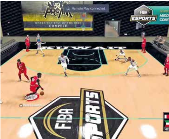
Action from Bahrain's game three victory over Kuwait last night

Bahrain scraped through to the championship round of the Middle East Conference in the FIBA Esports Open III last night, following a thrilling 71-70 victory over Kuwait in game three of their semi-finals series. National team character "||-Rodman-||", controlled by Jassim Ali, buried the game-winning three-pointer in the dying seconds to help lift the Bahrainis to their triumph. The result made it 2-1 for Bahrain in the best-of-three clash. It was a comeback in the series for the nationals, who lost the first game 68-74 before bouncing back 81-62 in game two to level the semis series 1-1. Bahrain now move on to face