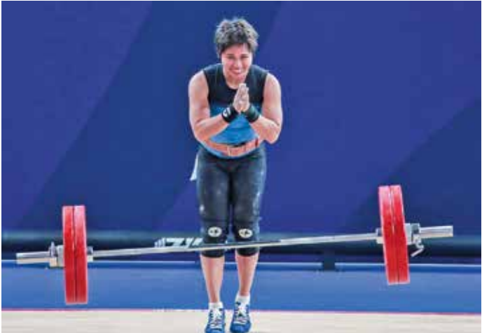
Diaz ... first Filipino athlete to reach four straight trips to the Olympics

"I've been waiting for so long for this event, and I am happy that it's finally happening," said the 30-year-old Diaz, who will become the first Filipino athlete to reach four straight trips to