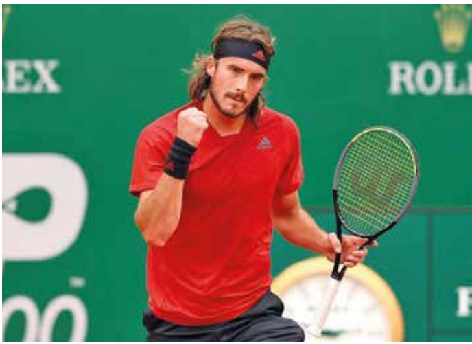
Stefanos Tsitsipas reacts during the match

"A lot of beautiful things happened in Monaco, for my family and I would really like to carry on this tradition," Tsitsipas said enigmatically, simply specifying