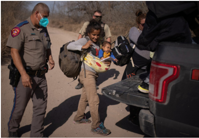
A woman holds her four-month son as she prepares to get in the back of a pickup truck for transport after crossing the Rio Grande River into the United States from Mexico in Penitas