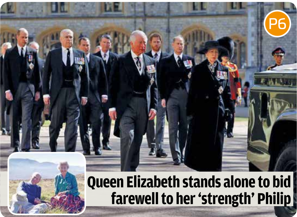
Queen Elizabeth stands alone to bid farewell to her 'strength' Philip