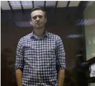
Alexei Navalny attends a court hearing in Moscow

The Moscow state prosecutor said it had decided to appeal to the court after studying Navalny's Anti-corruption Foundation and campaign groups that he has built up in