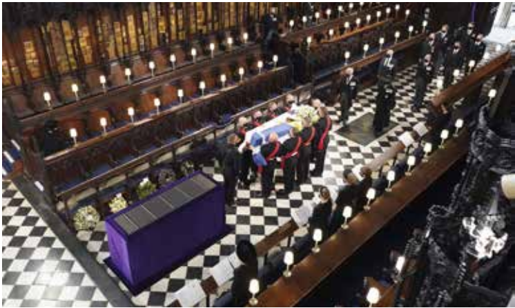
The Queen watches as pallbearers carry the coffin of Prince Philip

Link to one another after Prince Philip's funeral