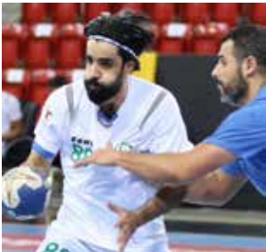
Action from Bahrain Club's win over Samaheej