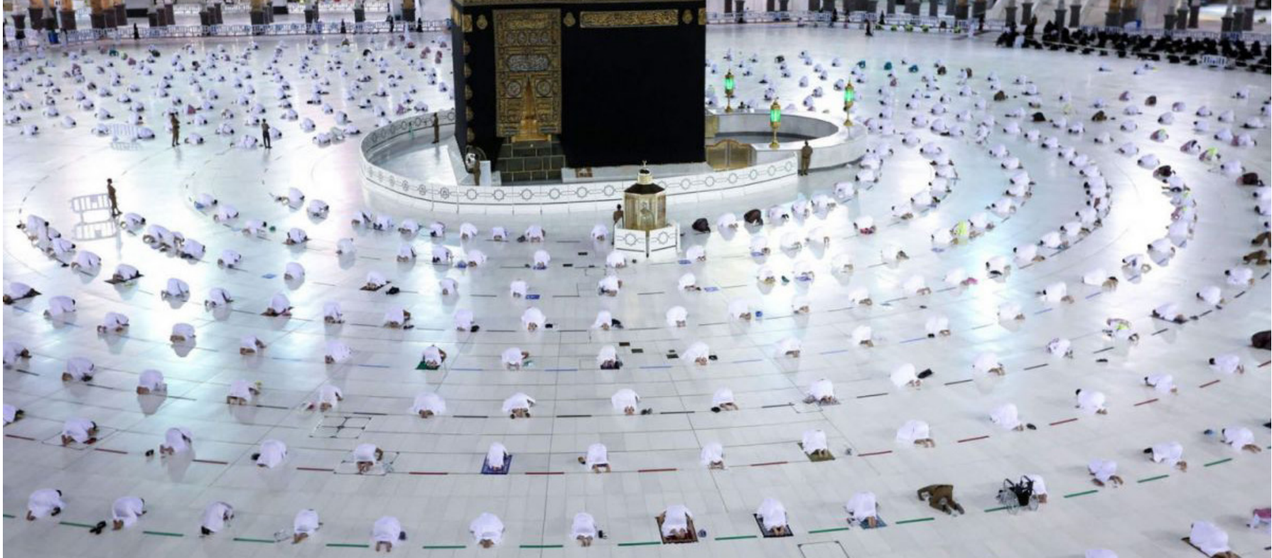
Muslim worshippers perform the evening Tarawih prayer around the Kaaba in the Grand Mosque complex in the holy city of Mecca

Islam is about giving and this month is especially about show-