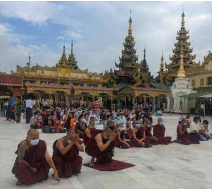
Buddhist monks visit Shwedagon pagoda following the Thingyan festival that marks the Burmese New Year in Yangon

The junta is planning to release more than 23,000 prisoners nationwide, an official said Saturday, even as the military continues to detain and issue arrest warrants for anti-coup dissidents. Myanmar typically grants an annual amnesty to thousands of prisoners to mark its traditional Buddhist New Year holiday -- which in previous years have been joyous affairs with city-wide water fights. But this year, with the military back in power after ousting civilian leader Aung San Suu Kyi, anti-coup activists have used the holiday as an opportunity to protest the growing death toll and mass arrests. It remains unclear whether anti-junta protesters or journalists jailed covering the coup will be among those freed. A prison official told AFP on condition of anonymity that jails across the country will start freeing more than 23,000 people on Saturday. “We will release more than 800 prisoners from Insein prison” in commercial hub Yangon, he added, declining to elaborate. In February, the junta released a similar number of prisoners, with some rights groups at the time fearing the move was to free up space for opponents of the military as well as cause chaos in communities. On Wednesday a rebel group executed a man who had been freed in that amnesty, who it said had subsequently raped and killed a five-year-old girl. Just before Armed Forces Day, the regime also freed around 900 jailed demonstrators.