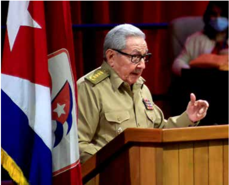
Raul Castro speaks as the Communist Party of Cuba opens a historic congress in Havana

States told its Havana station to cancel the mission.