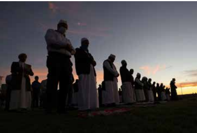
Muslims pray as they await the sighting of the moon that marks the start of the holy month of Ramadan on the Sea Point promenade in Cape Town

This is the spirit of Ramadan. This is what Ramadan is all about: feeling directly for a month what millions of human beings are going through daily throughout the year, and trying our best to change their situation for the better in the long term. This requires that we prepare and train ourselves for this important task. The month of Ramadan is supposed to provide that training. So why not start with this Ramadan? Who knows what will happen until next Ramadan?