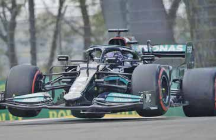
Lewis Hamilton launches off a raised kerb

"There were times when they were six-tenths ahead and we didn't really know where we'd be. But the car was already feeling a lot better from the begin-