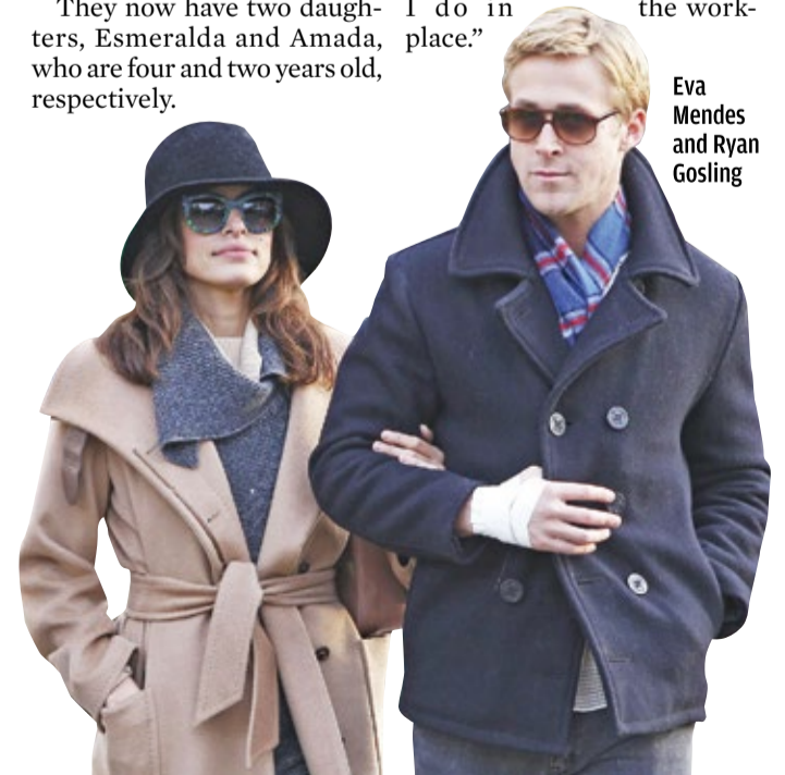
Eva Mendes and Ryan Gosling

The star said opposed to her career, her biggest drive at the moment are her two daughters "(I) felt a lack of ambition when I became a mother and now I feel more ambitious in the home right now than I do in the workplace."