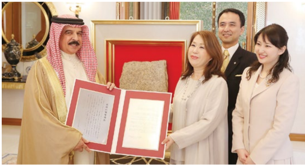
His Majesty receives 'Stone of Peace' honour from the Japanese delegation.

HM King Hamad expressed pride in the solid Bahraini-Japanese relations, and in the steady growth of the deep-rooted bilateral cooperation and joint action in many fields, in light of the