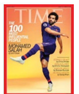
Salah joins various world leaders in the list.

Salah is joined by fellow Arab and Muslim celebrities such as Rami Malek and Mahershala Ali, as well as Abu Dhabi's Crown Prince Mohammed bin Zayed Al Nahyan.