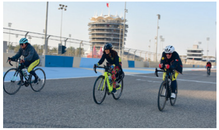
Participants ride cycles at the BIC

splenty of action in cuit. Autocross held at BIC's car park, Day was organised by various