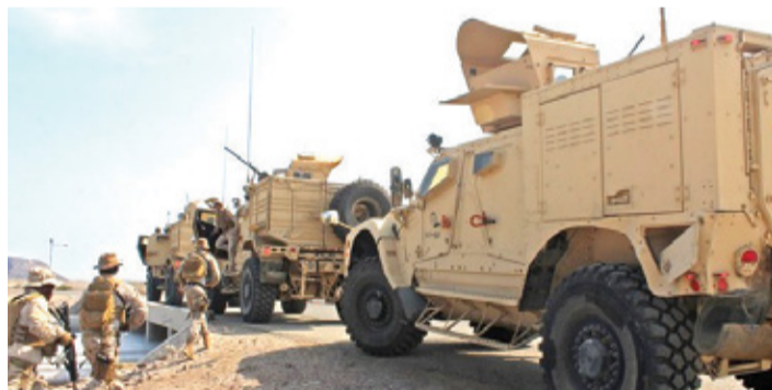
Clashes with Yemen troops has led to the deaths of scores of Houthi militia.

According to the reports, more than 40 militants were killed in the southern Taiz province, and 18 others were killed on the