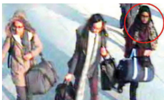
Ms Begum fled to Syria with her two friends four years ago.

"I'm afraid he might even die in this camp. I feel a lot