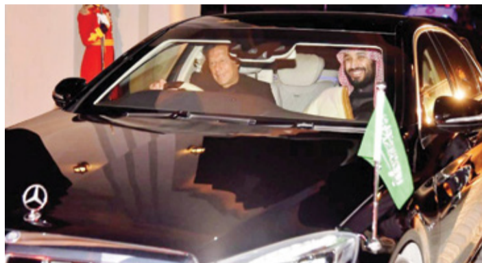
Imran Khan drives a vehicle as he receives Saudi Arabia's Crown Prince Mohammed bin Salman on his arrival at Pakistan Air Force (PAF) Nur Khan Base in Rawalpindi, Pakistan.

The two leaders later addressed the ceremony and their