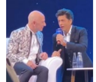
Jeff Bezos and Shah Rukh Khan

Mumbai Amazon CEO Jeff Bezos got a whiff of Bollywood superstar Shah Rukh Khan's trademark wit at an interaction in Mumbai on Thursday.