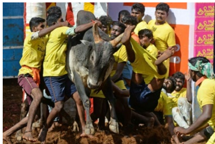
Men in colourful jerseys tried to grab the bulls who swayed their long horns and gnarled in fury