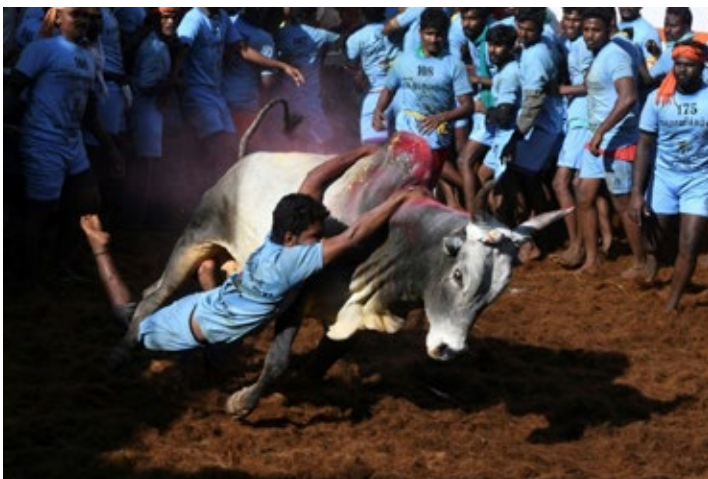
On the opening day of the bull-taming festival in India's Madurai city, more than 20 men were injured