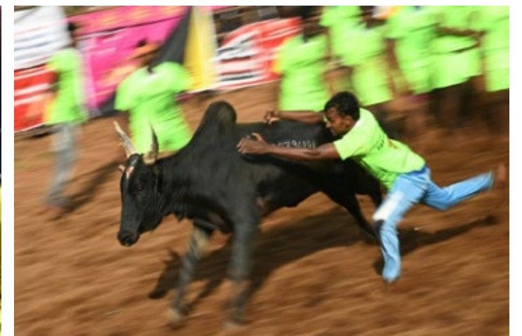
In past years, competitors have been gored to death