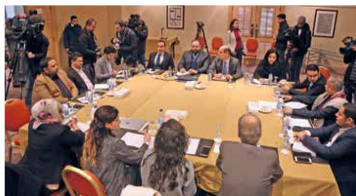
Representatives of Huthis and a Yemen government delegation meet in the Jordanian capital Amman

The new meetings come after the UN Security Council on