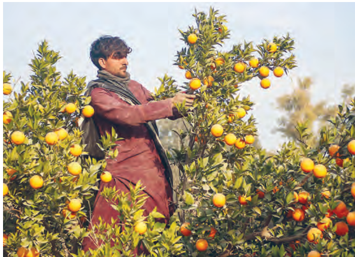
An Afghan farmer harvests oranges from an orchard at Bati Kot district in Nangarhar province

More than 17 million people are facing acute food insecurity: "three million more than last year", he told a press briefing