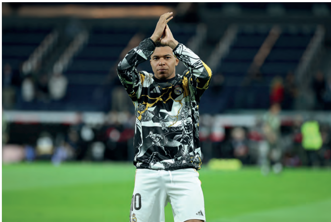
Real Madrid's French forward #10 Kylian Mbappe applauds during the warm up before a match (file photo)

figure of between 60 million and 61 million euros was made up of 55 million euros in unpaid salary and around six million euros in holiday payments.