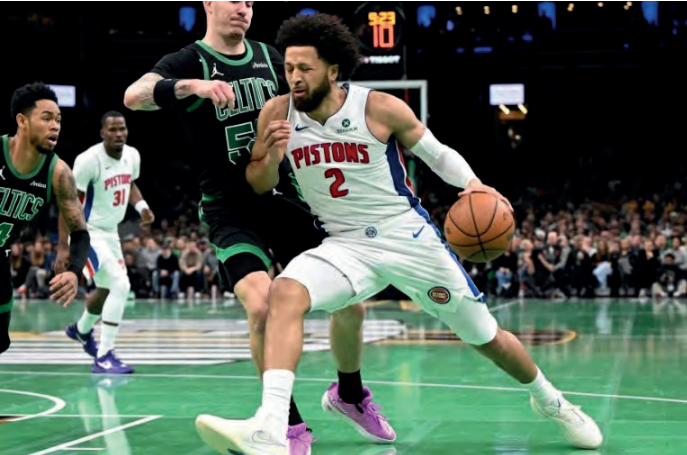
Cade Cunningham in action

Cade Cunningham scored 32 points as the Detroit Pistons held off the Boston Celtics 112-105 to extend their lead at the top of the Eastern Conference standings on Monday. Pistons point guard Cunningham produced another potent offensive display in a back-and-forth duel that saw the lead change hands 15 times before Detroit pulled away in the final minutes. Cunningham, averaging just under 27 points this season, rattled in six three-pointers in 11-of-21 shooting from the field to help Detroit improve to 21-5 in the Eastern Conference. But Detroit were made to work hard for their fourth straight win after a dogged per-