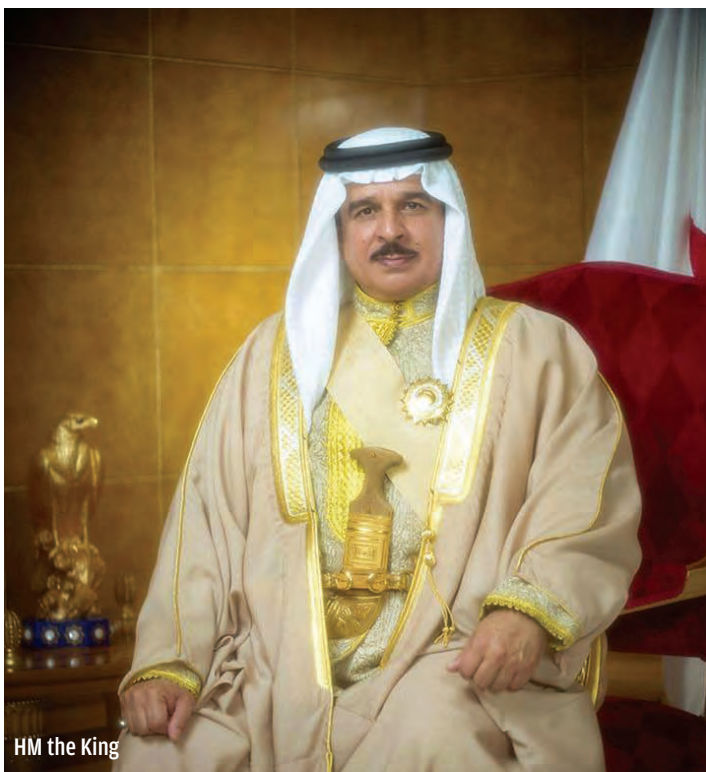
HM the King

He said: “As we observe this precious anniversary — rich in lessons of glory and the unity of the national ranks — we are re-