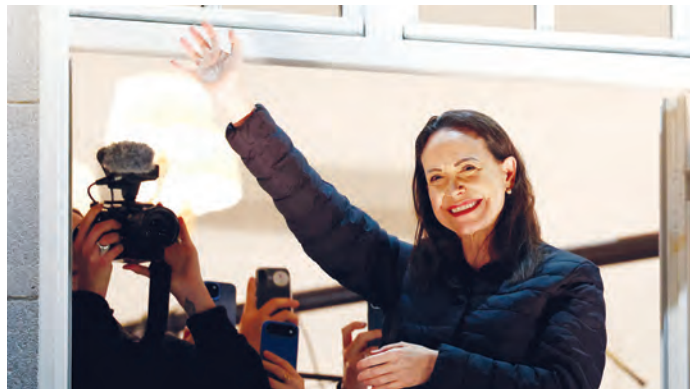
Nobel peace laureate Maria Corina Machado greets supporters from a balcony of the Grand Hotel in Oslo, Norway

After arriving in Oslo in the early hours of Thursday, the 58-year-old had on several occasions said she wanted to see a doctor, without providing any