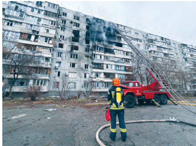
A firefighter looks at a damaged residential building following an air attack in Zaporizhzhia