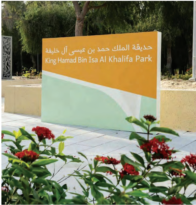
Providing visitors with a unique natural experience

Additional facilities include a bicycle track, elevated paths for skiing and jumping bikes, open grassy areas, yoga and meditation platforms, children's play zones, and spaces for senior citizens and persons with disabilities.