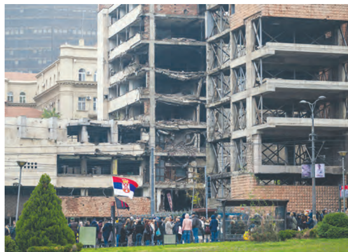
Serbian students and Belgrade residents gather for a protest in Belgrade on November 11, 2025, against a plan by Jared Kushner, the son-in-law of US President, to demolish the former Yugoslav army headquarters and build a luxury hotel on the site.

● Serbian Minister and three others were indicted over removal of the site's "cultural-heritage status"