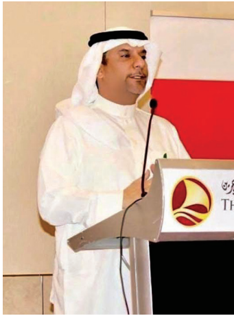
Prince and Prime Minister.”

On the occasion, H.E. Dr. bin Daina affirmed that “the comprehensive development renaissance and the qualitative achievements witnessed by the Kingdom across various sectors are the direct result of the wise vision of His Majesty the King and the directives of His Royal Highness Prince Salman bin Hamad Al Khalifa, the Crown