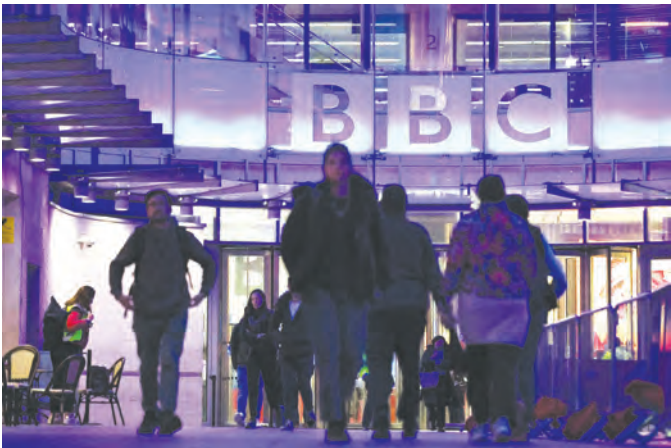
People use the entrance to the offices of British broadcaster BBC in London in the late afternoon