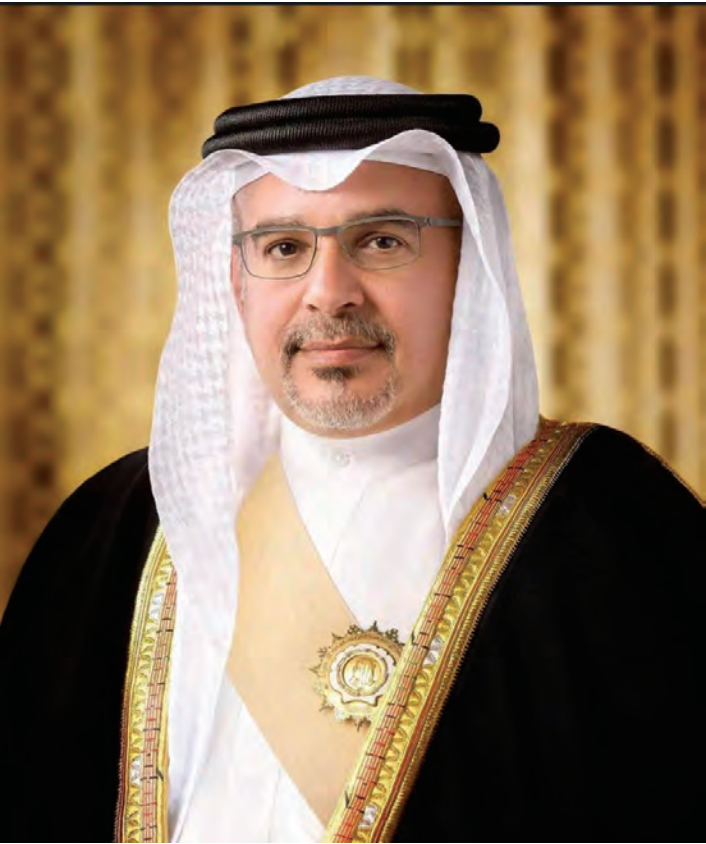
HRH Prince Salman

ments,” underpinned by a strong and resilient economy built on sustainable foundations. Dividends He affirmed that the dividends of this economic growth will directly benefit citizens, driving constructive economic activity and expanding development opportunities across all sectors. His Royal Highness affirmed that the Kingdom’s continued progress across all fields is guided by the leadership and vision of HM the King. He noted that this foresight has laid the foundations for comprehensive development that places citizens at its core. “Our national achievements stem from the spirit of one team, working together to serve Bahrain and advance its aspirations,” His Royal Highness said, emphasising that the unity and commitment of citizens remain central to achieving national goals. Growth Highlighting economic progress, HRH the Crown Prince and Prime Minister stated that “the establishment of a resilient