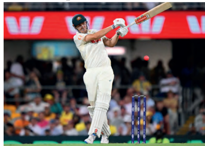
Cameron Green plays a shot (file photo)