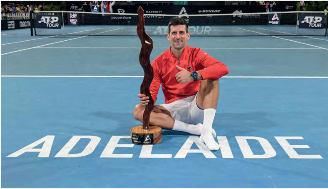
Novak Djokovic celebrates after winning the final of the ATP Adelaide International tournament in 2023

The 38-year-old world number four has competed at Ade-