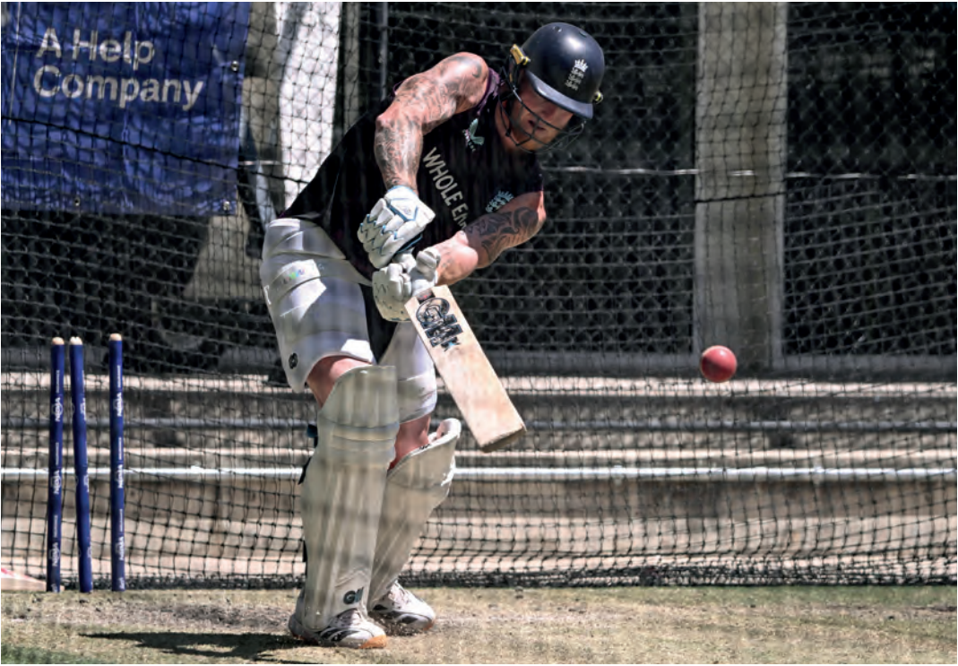
England’s captain Ben Stokes bats in the nets during a training session

England’s captain Ben Stokes has demanded England “show a bit of dog” in the must-win third Ashes Test against Australia today after “raw” conversations following heavy defeats in Perth and Brisbane. The tourists have crashed to consecutive eight-wicket losses and must snap a 17-match winless streak in Australia at Adelaide Oval to keep the five-match series alive. They have made one change with Josh Tongue replacing fellow quick Gus Atkinson, while off-spinning all-rounder Will Jacks kept his place ahead of Shoaib Bashir. Stokes said after the Gabba defeat that Australia was “no place for weak men” and admitted to hard dressing-room discussions in the aftermath. “What’s been said has been said,” Stokes told reporters. “I’ve done all the talking over