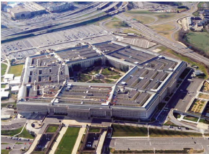
Washington, United States

US officials are working on a plan for a reorganization of the military requested by Pentagon chief Pete Hegseth that would reduce four-star generals and consolidate some international command centers, the Washington Post reported on Monday.