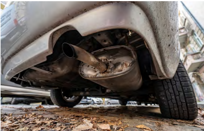
An exhaust pipe for a car with a combustible engine is seen in Berlin

"This is a critical milestone for the future of the sector. There is a lot at stake," Sigrid