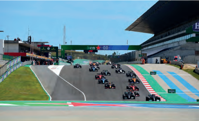
A view of Autodromo Internacional do Algarve during a Formula One race (file photo)

The Portuguese Grand Prix in Portimao will return to the Formula One schedule on a two-year agreement for 2027 and 2028, organisers announced yesterday. The race was previously held at the Algarve circuit in 2020 and 2021 during the Covid pandemic, with both editions won by Lewis Hamilton. Portugal hosted a GP between 1984 and 1996 in Estoril, after previous iterations elsewhere from 1958-1960.