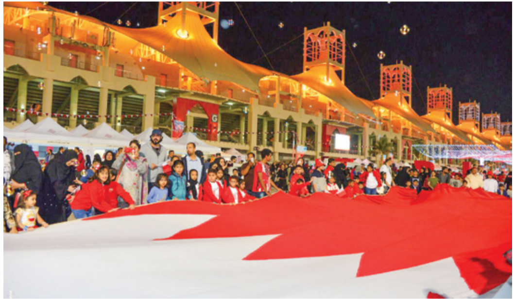
Hundreds flocked to Bahrain International Circuit (BIC) yesterday to witness National Day celebrations.