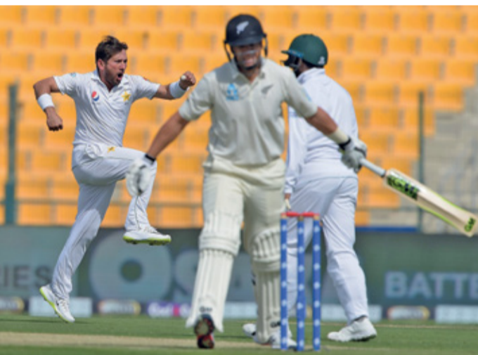
Pakistani spinner Yasir Shah (L) celebrates after taking the wicket of New Zealand batsman Ross Taylor (C)