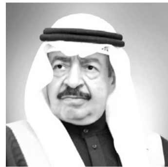
HRH the Premier

The first award, was delivered in 2008 to the “Green Brigade