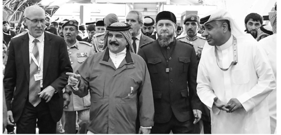
His Majesty King Hamad bin Isa Al Khalifa, accompanied by Chechen President Ramzan Kadyrov, paid a visit to Bahrain International Air Show 2018. The two leaders visited the United Arab Emirates pavilion, Russian pavilion and listened to a brief on the Russian airplanes specifications and performance data. They also visited the Saudi Military Industries Company and a number of US companies pavilions, where they were briefed on the companies roles at the military and civil levels.