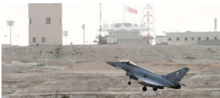
Many defence, aerospace companies showcased their latest defence aircraft, military vehicles at the air show.

930,200 Bahraini dinars is the value of the deal signed between the Ministry and ADPI.