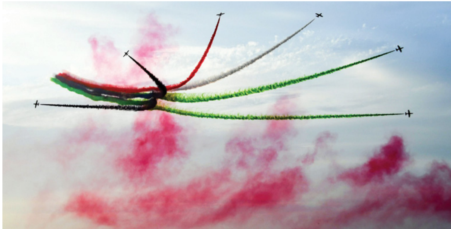
Spectacular displays were delivered by participating teams at the air shows.

His Majesty King Hamad bin Isa Al Khalifa, and under the supervision of His Highness Shaikh Abdulla bin Hamad Al Khalifa, Personal Representative of HM the King and Chairman of the Supreme Organising Committee, the fifth edition of the Bahrain International Airshow witnessed unprecedented growth with more participation in the event than