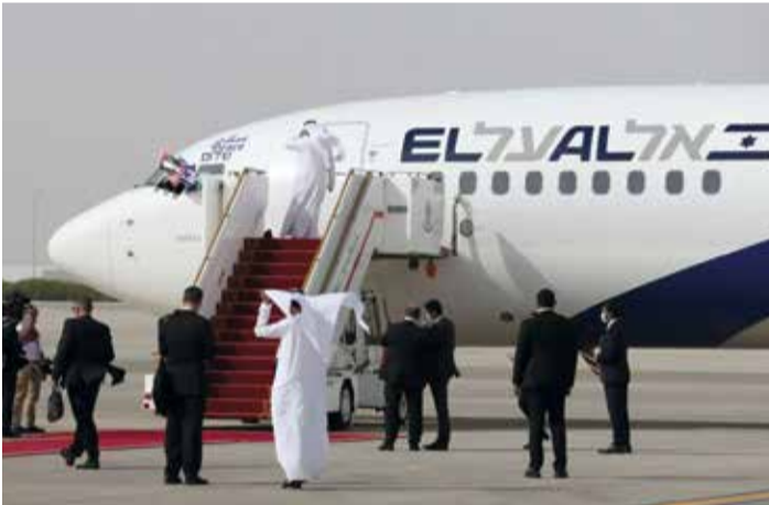
El Al's airliner carrying Israeli and US delegates at Abu Dhabi International Airport.

The first official delegation to Israel from the United Arab Emirates may remain at the airport and fly home the same day, rather than conduct a wider visit, due to coronavirus precautions, an Israeli minister said. Israel is under a second coronavirus lockdown, which it