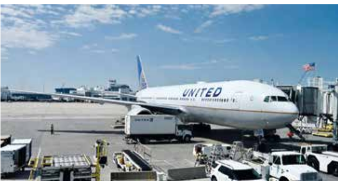
Researchers used sensors and fluorescent tracers for the study

The risk of being infected with the coronavirus on an airliner is very low if passengers wear masks, according to a study carried out aboard Boeing long-haul jets by the US military. Researchers using sensors and fluorescent tracers measured the volume of airborne contagious matter emitted by a dummy simulating an infected person breathing normally. The passengers most exposed