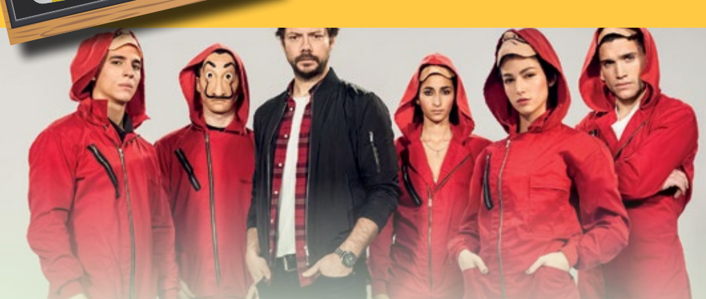
This week, Nebal Shafi reviews the third season of the Netflix show 'Money Heist'.

Streaming services have ushered in a whole new kind of reach and visibility for creativity in the field of 'filmmaking'. Whether they are short films, feature films, mini-series or full-blown web series, we are presently spoilt for choice. Weekender will review one production every week, so you can add or take it off your to-do list for the weekend!