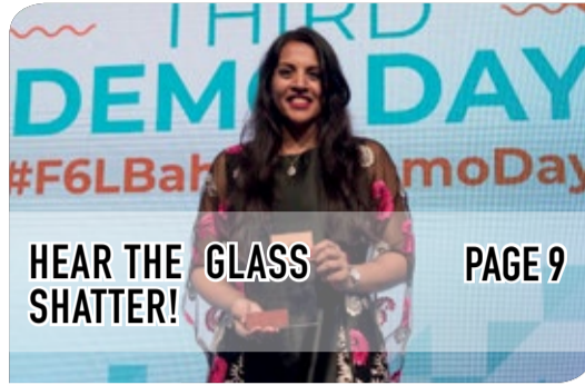
HEAR THE GLASS SHATTER! PAGE 9