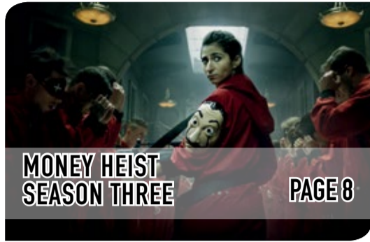
MONEY HEIST SEASON THREE PAGE 8