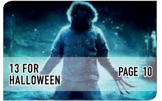
13 FOR HALLOWEEN PAGE 10