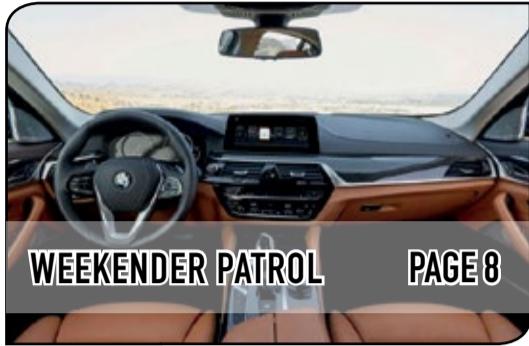
WEEKENDER PATROL PAGE 8

Because every week deserves a happy ending