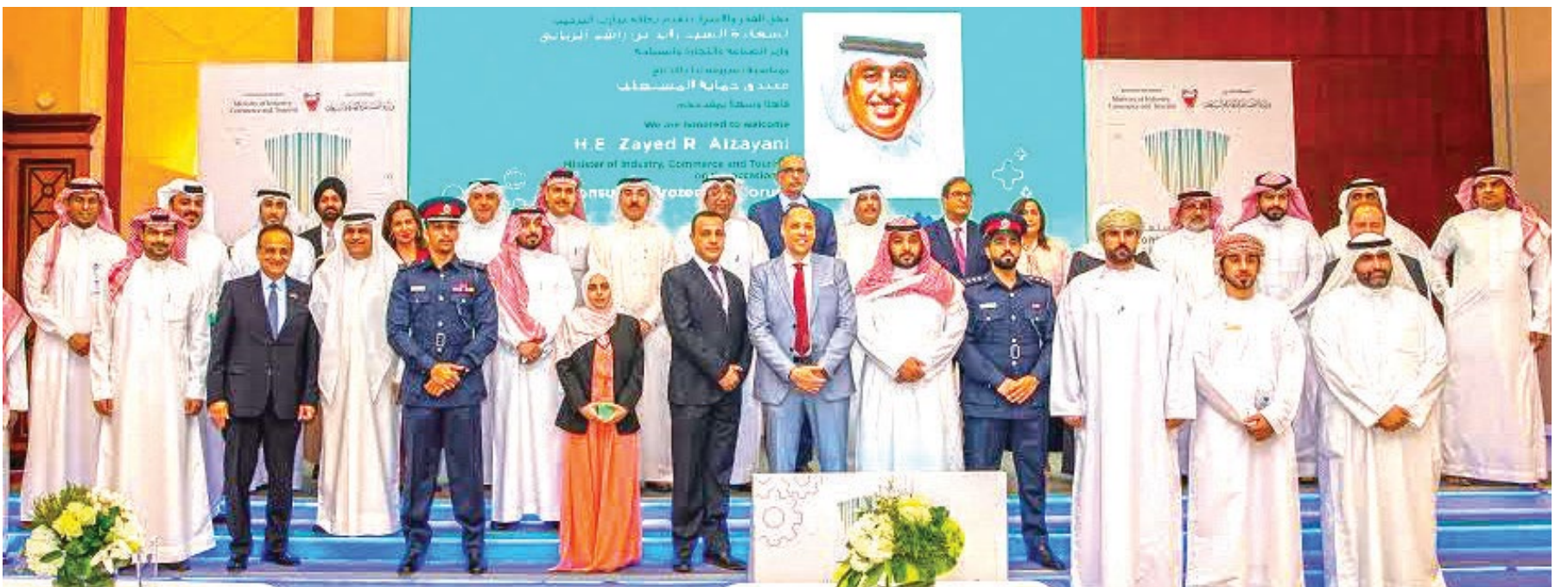
Senior government officials with other dignitaries attended the event.