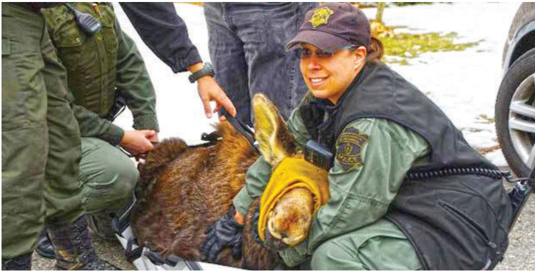
'Environmental police' concept has gained huge popularity in Western countries.

ation with the Ministry of Interior to tackle environmental violations."