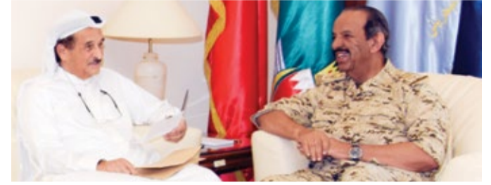
Field Marshal Shaikh Khalifa bin Ahmed Al Khalifa, Commander-in-Chief of Bahrain Defence Force (BDF) received Lt-General Dr Shaikh Mohammed bin Abdullah Al Khalifa, President of the Supreme Council for Health. The BDF Commander-in-Chief lauded the council's considerable efforts to develop and enhance the health services provided to citizens and residents in the Kingdom.