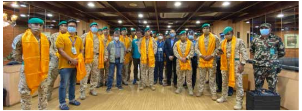
The Bahrain team with Nepal officials upon their arrival