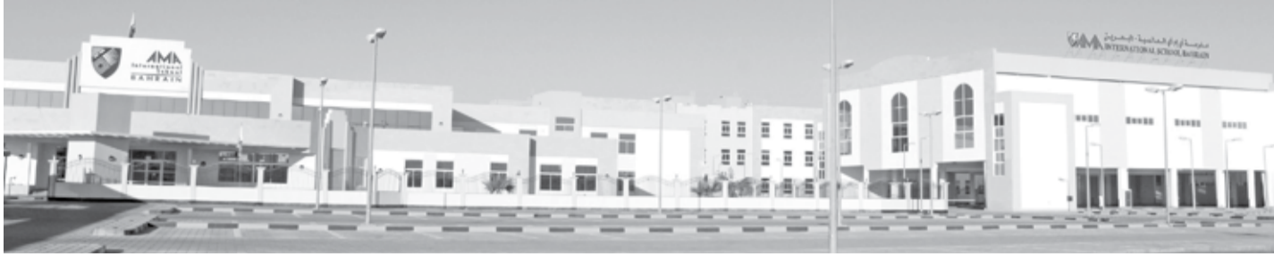
AMA International school

Likewise, the school took pride as being the 6th member school of the Council of Inter-