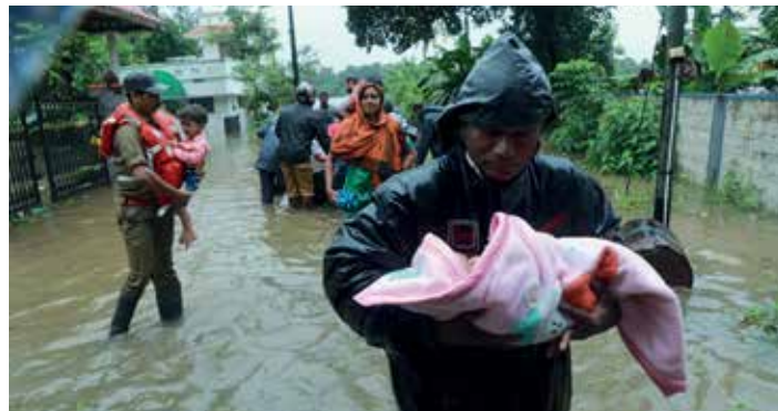
Fire and Rescue personnel evacuate local residents in an inflatable boat from a flooded area at Muppathadam near Eloor in Kochi's Ernakulam district

At least eight people were killed when an irrigation dam burst and a landslide hit three houses in the town of Nemmara, Palakkad district, authorities said. Vijayan said 80 dams have reached danger levels and ap-