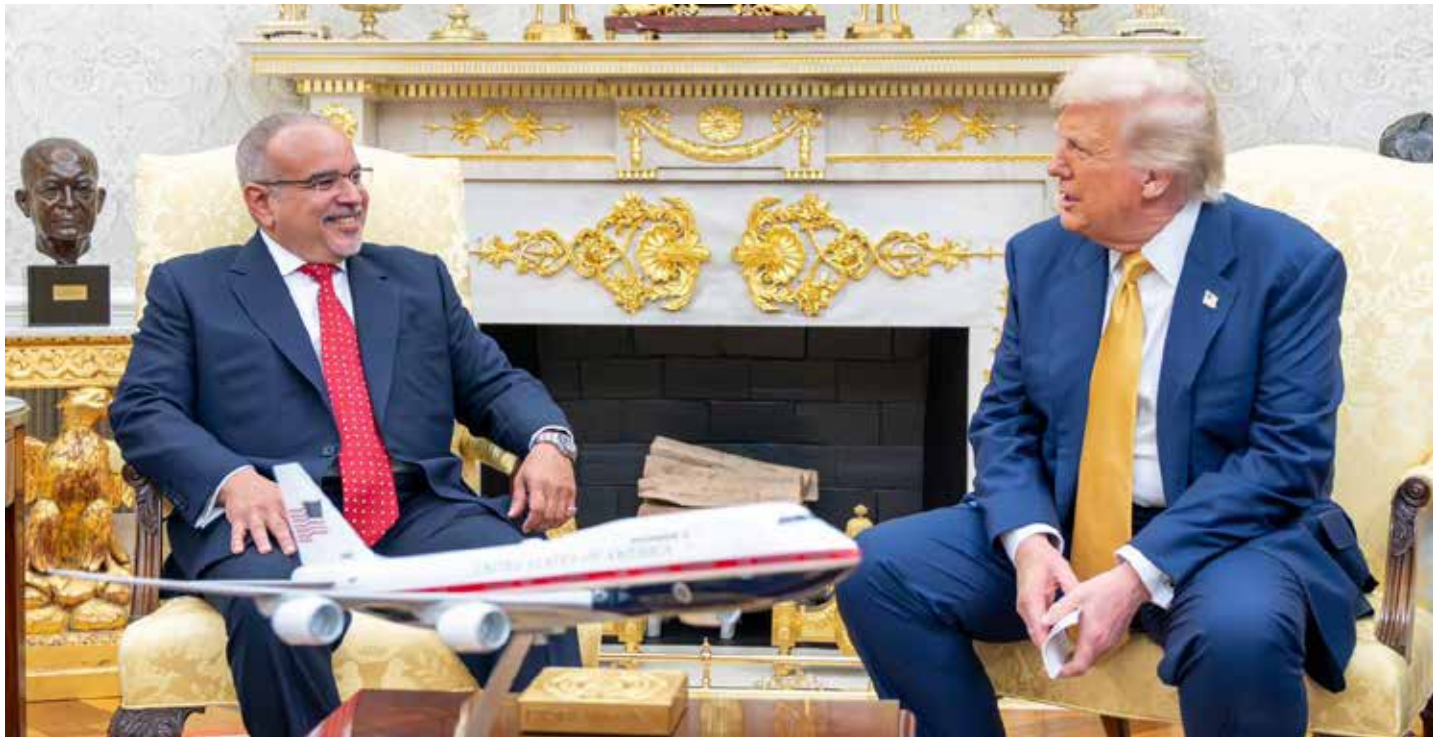
HRH Prince Salman holds talks with US President Trump.

During high-level talks at the White House, HRH Prince Salman met with US President Donald Trump to discuss deepening security and economic ties.