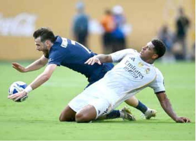
Paris Saint-Germain’s Georgian forward #07 Khvicha Kvaratskhelia and Real Madrid’s English midfielder #05 Jude Bellingham fight for the ball