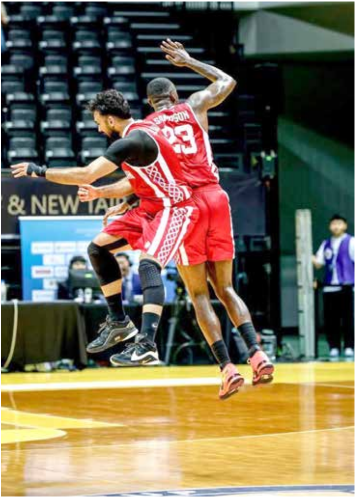
Celebrations at full time