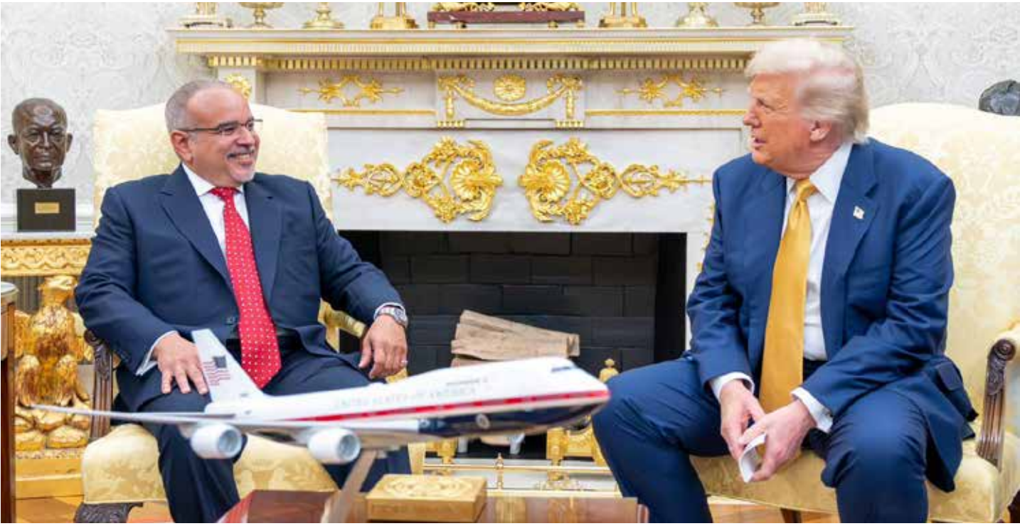
HRH Prince Salman holds talks with US President Trump.

During high-level talks at the White House, HRH Prince Salman met with US President Donald Trump to discuss deepening security and economic ties.