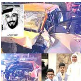
Family's joy shattered in tragic crash that claimed three lives

His driving licence was suspended for a year after serving