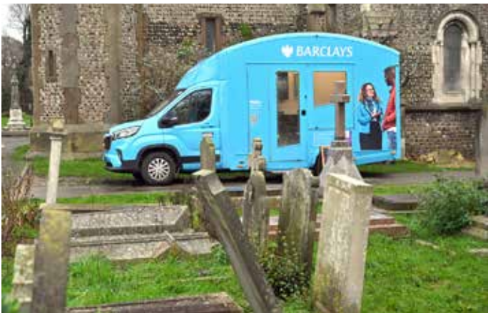
A Barclays mobile banking van is pictured in the grounds of St Andrew's Church in Hove, southern England

They added in a statement that "Barclays fully cooperated with both investigations and has further strengthened its financial crime and other control