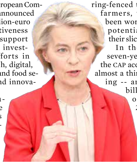
European Commission President Ursula Von der Leyen

In the current seven-year budget, the CAP accounted for almost a third of funding -- around 387 billion euros, of which 270 billion euros are directly paid to farmers.