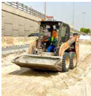
Road work in progress