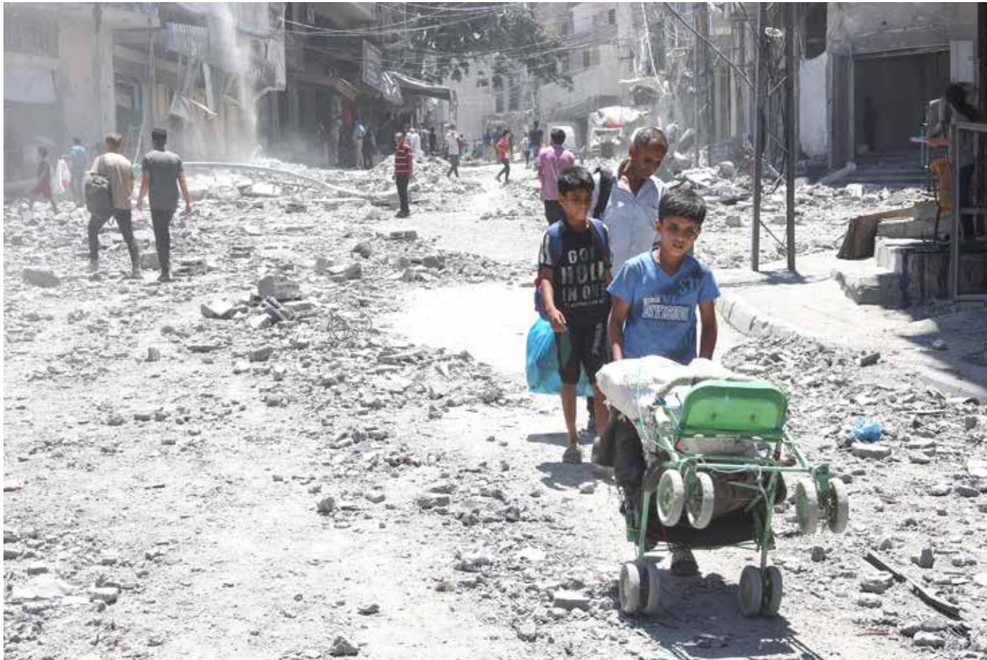
Palestinians search for items to salvage in the rubble of buildings destroyed a day earlier in Israeli strikes on Al-Daraj neighbourhood in Gaza City