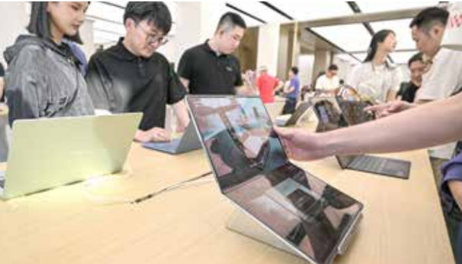
People look at a Huawei MateBook Fold (R) in a Huawei Store in Shanghai