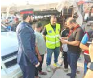
Checking expat workers' legal status