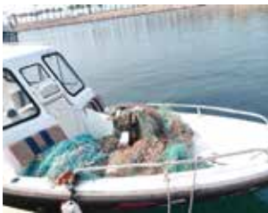
Seized evidence from the suspects