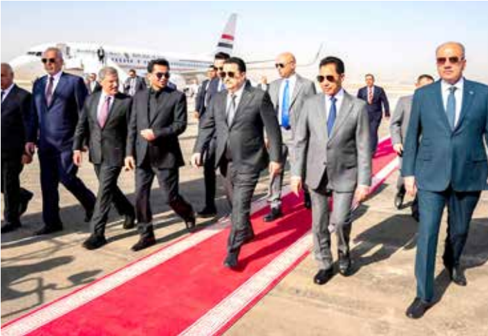
Prime Minister Mohammed Shia al-Sudani being received by officials during the re-opening of Mosul International Airport in northern Iraq

jihads seized Mosul. In August 2022, then-prime minister Mustafa al-Kadhimi laid the foundation stone for the airport's reconstruction. Airport director Amar al-Bayati told AFP that the "air-