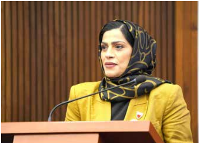
MP Basema Mubarak

Member of Parliament Basema Mubarak described the outcome as a "turning point" in bilateral ties and said it reflects