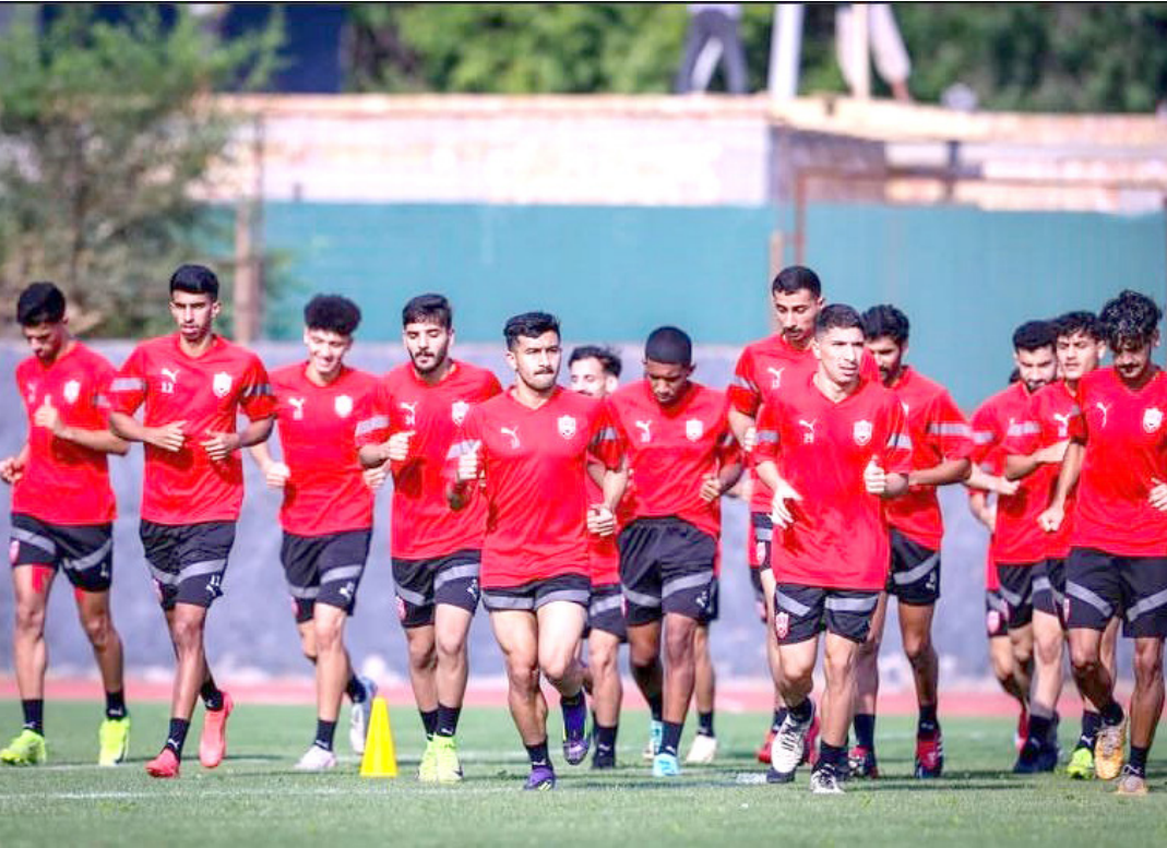
Bahrain's U23 squad in training