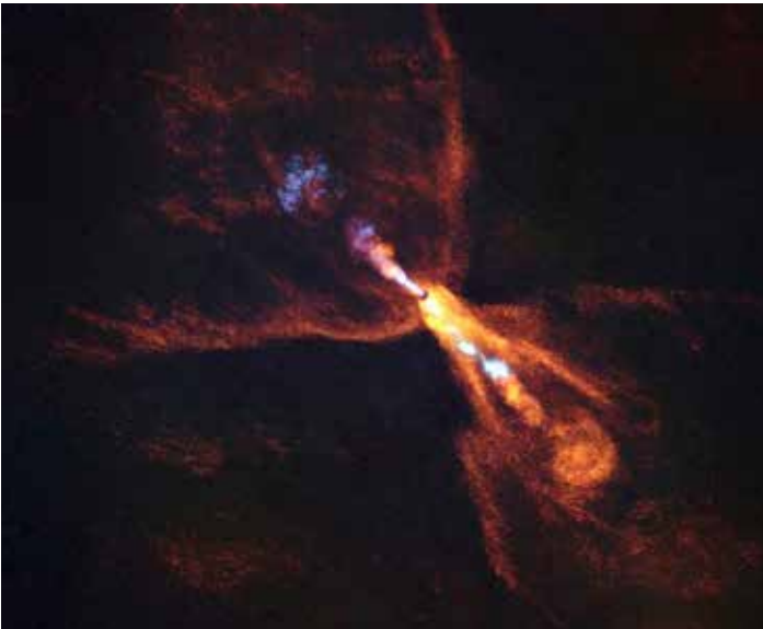
This mage released by the European Southern Observatory (ESO) and taken with the Atacama Large Millimetre/submillimetre Array (ALMA) shows HOPS-315, a baby star where astronomers have observed evidence for the earliest stages of planet formation. Jupiter's core are believed to have been trapped in ancient meteorites. Now astronomers have spotted signs that suggest these hot

Astronomers said yesterday they had observed the moment when planets start forming around a distant star for the first time, revealing a process that sheds light on the birth of our own solar system. The new planetary system is forming around the baby star HOPS-315 -- which resembles our own Sun in its youth -- 1,300 light years from Earth in the Orion Nebula. Young stars are surrounded by massive rings of gas and dust called protoplanetary discs, which is where planets form. Inside these swirling discs, crystalline minerals that contain the chemical silicon monoxide can clump together. This process can snowball into kilometre-sized "planetesimals", which one day grow into full planets. In our home Solar System, the crystalline minerals that were the starter dough for Earth and