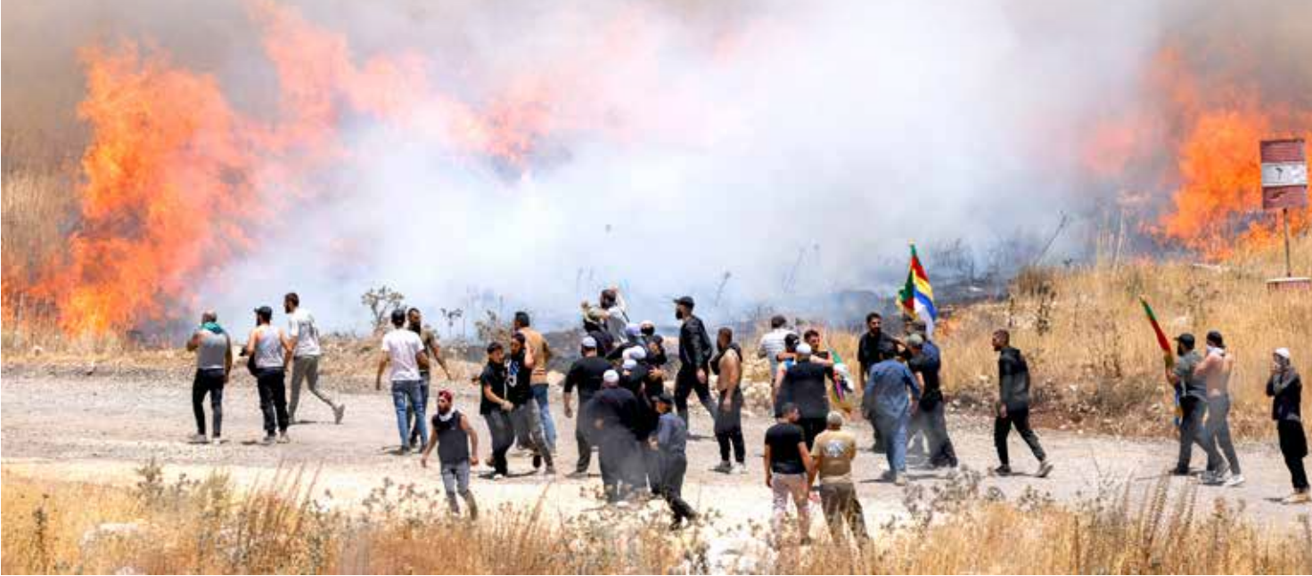
Members of Syria's Druze community walk through tear gas fumes released by Israeli forces to disperse them, as they gather along the dividing line to attempt to cross the barbed-wire fence with the Israeli-annexed Golan Heights near Majdal Shams