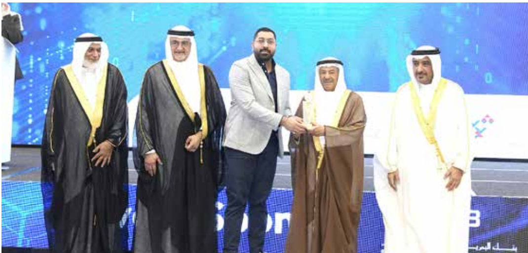
The award ceremony

Lumofy was recognised for its AI-powered Talent Management Platform, which helps organisations identify, develop, and activate employee skills in alignment with evolving labour market demands. The platform's use of artificial intelligence to streamline talent development and workforce transformation