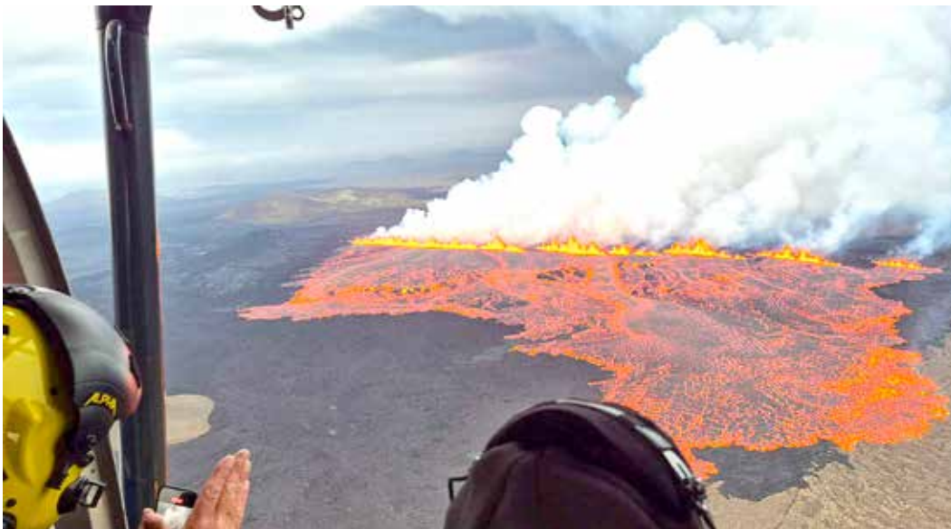
Lava and smoke erupting from a volcano near Grindavik on the Icelandic peninsula of Reykjanes

Broadcaster RUV reported that the nearby fishing village Grindavik had been evacuated, as had the Blue Lagoon, Iceland's famed tourist spot.