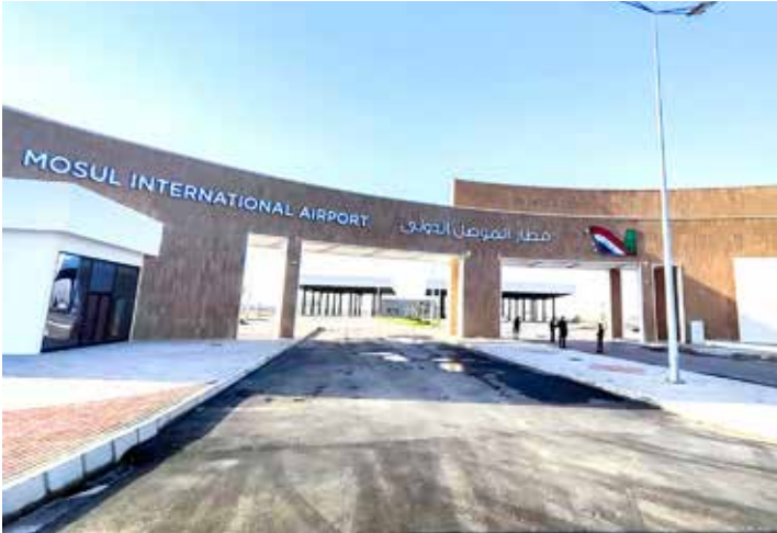
A view of Mosul International Airport in northern Iraq

Iraqi Prime Minister Mohammed Shia al-Sudani inaugurated yesterday the city of Mosul's newly restored airport, years after it was destroyed in the battle to dislodge the Islamic State group. Sudani's flight landed at the airport, which is expected to become fully operational for domestic and international flights in two months. "The airport will serve as an additional link between Mosul and other Iraqi cities and regional destinations," the media office of the PM said in a statement. In June 2014, the Islamic State group seized Mosul, declaring its "caliphate" from the city after capturing large swathes of Iraq and neighbouring Syria. After years of fierce battles, Iraqi forces backed by a US-led international coalition dislodged