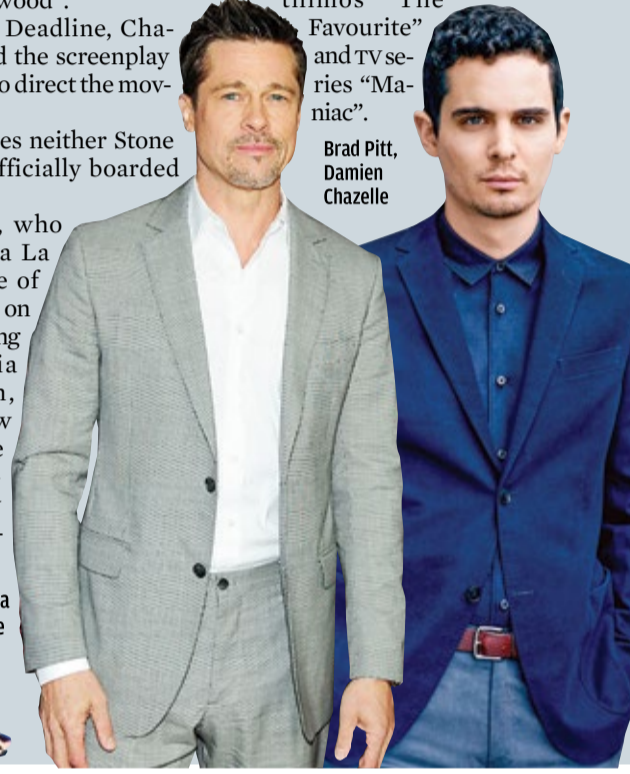
Brad Pitt, Damien Chazelle

The filmmaker is right now busy with his Netflix series "The Eddy", while Stone is fresh out of the success of Yorgos Lanthimos' "The Favourite" and TV series "Masters of Sex".