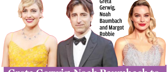
Greta Gerwig, Noah Baumbach and Margot Robbie