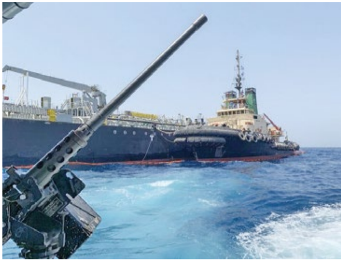
The Japanese oil tanker Kokuka Courageous was attacked in the Gulf of Oman last month.

The incident is the latest involving shipping in the region where tensions between Iran and the US have escalated in recent