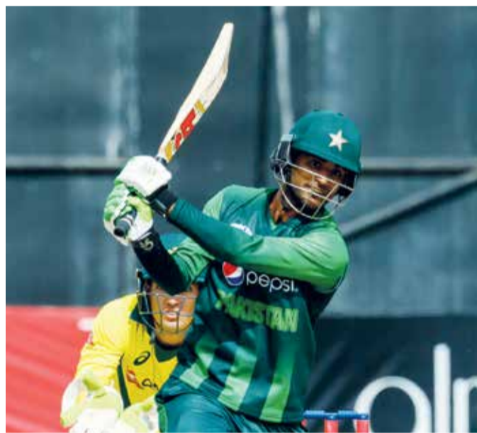
Pakistan batsman Fakhar Zaman in action