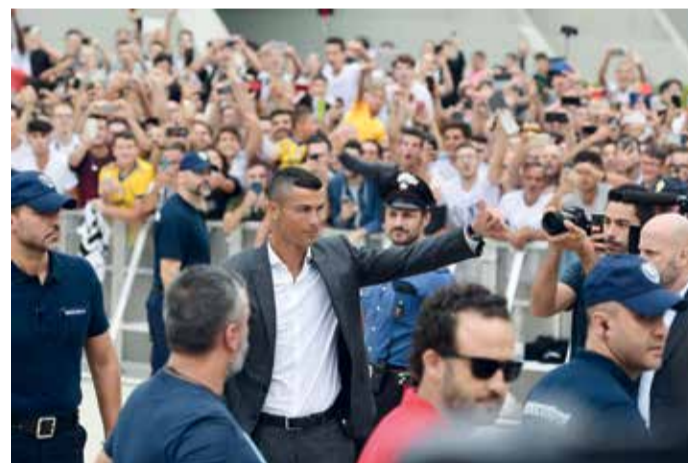
Ronaldo waves to supporters

Ronaldo fever hit Turin after the announcement last week of his 100 million-euro ($117 million) transfer from European champions Real Madrid, which Italian media reports will cost Juve a total of 350 million euros. Many of the youngsters who came out to greet their new hero were wearing Juventus shirts emblazoned with "Ronaldo" and the number 7, which have been selling like hot cakes in the city.