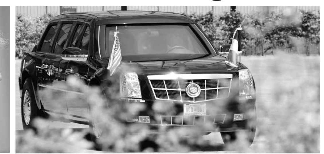
Trump arrives in the US official state car also known as "The Beast"