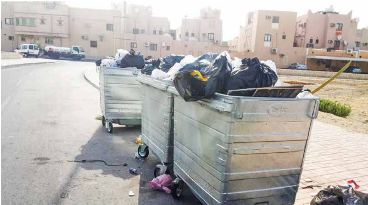
The Kingdom is one of the biggest per capita waste generators in the world.

"It takes six months to formulate the strategy and six months for it to be implemented. The draft is being