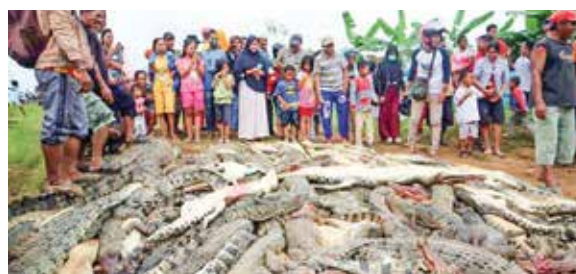
All 292 reptiles at the sanctuary were slaughtered by the mob.

Officials and police said they were not able to stop the attack and may now press charges. The killing of a protected species is a crime that carries a fine or imprisonment in Indonesia. The local villager was killed