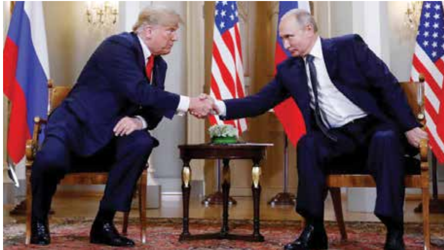
Trump and Putin shake hands as they meet in Helsinki.

● At the news conference, Trump was invited by reporters to offer any criticism of Russia but he repeatedly declined.